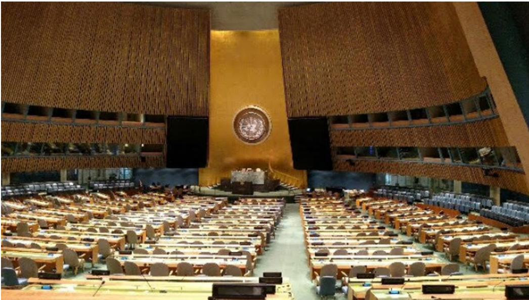
UN Assembly Room

The Commission of the Status of Women (CSW), a functional commission of the United Nations economic and Social Council (ECOSOC), is a global policy-making body dedicated exclusively to promoting gender equality and the empowerment of women. The commission was established by an ECOSOC resolution in 1946 with a mandate to prepare recommendations on promoting women's rights in the political, economic, civil, social, and educational fields. The Commission also makes recommendations to the Council on urgent problems requiring immediate attention in the field of women's rights.