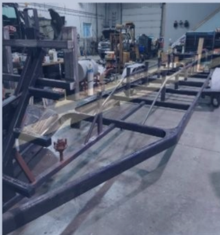
Figure 1 Before Photo