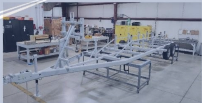
Figure 2 Post Paint