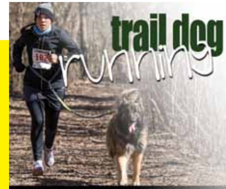
"A CaniCross Adventure"