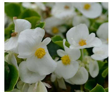
Green Leaf Begonias*