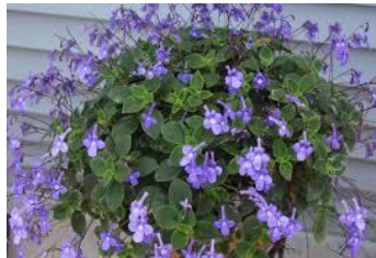
Streptacarpella (False Violets)