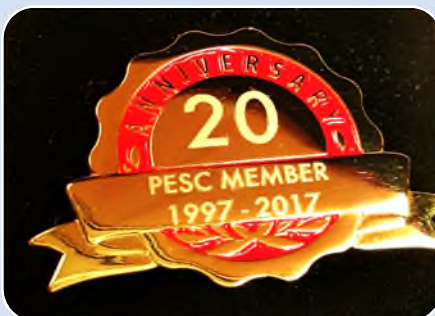
PESC approaches its 20th Year Anniversary with a celebration at the Fall 2017 Data Summit in Toronto!