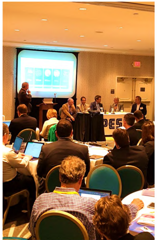
The Groningen Declaration Network panel discusses in-depth the mission and vision of this expanding global initiative.