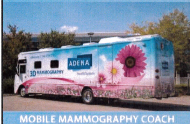
MOBILE MAMMOGRAPHY COACH

Sign up you (and your gal pals) NOW by calling 740.474.8831