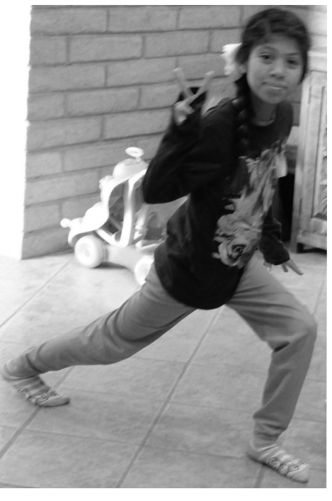
Above at age 12, she was doing lunges in the Physical

the other. She is a patient in the Physical Therapy Department , Orthotic and Prosthetic Department , and Orthopedics Department . She wears ankle-foot or-thoses (AFOs) and special shoes.