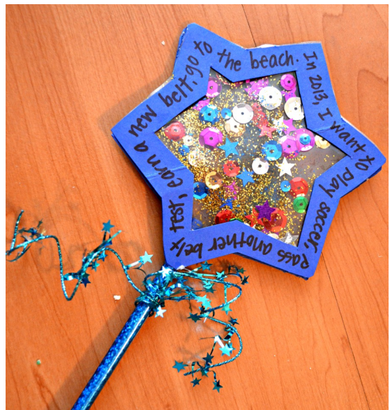
Wishing Wand Craft