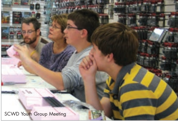
SCWD Youth Group Meeting