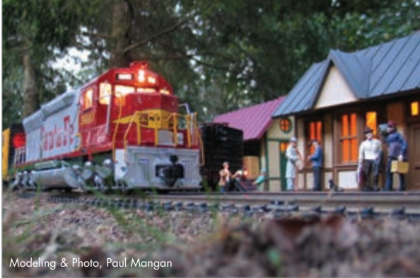
Modeling & Photo, Paul Mangan