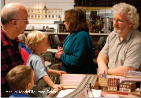
Annual Model Railroad School