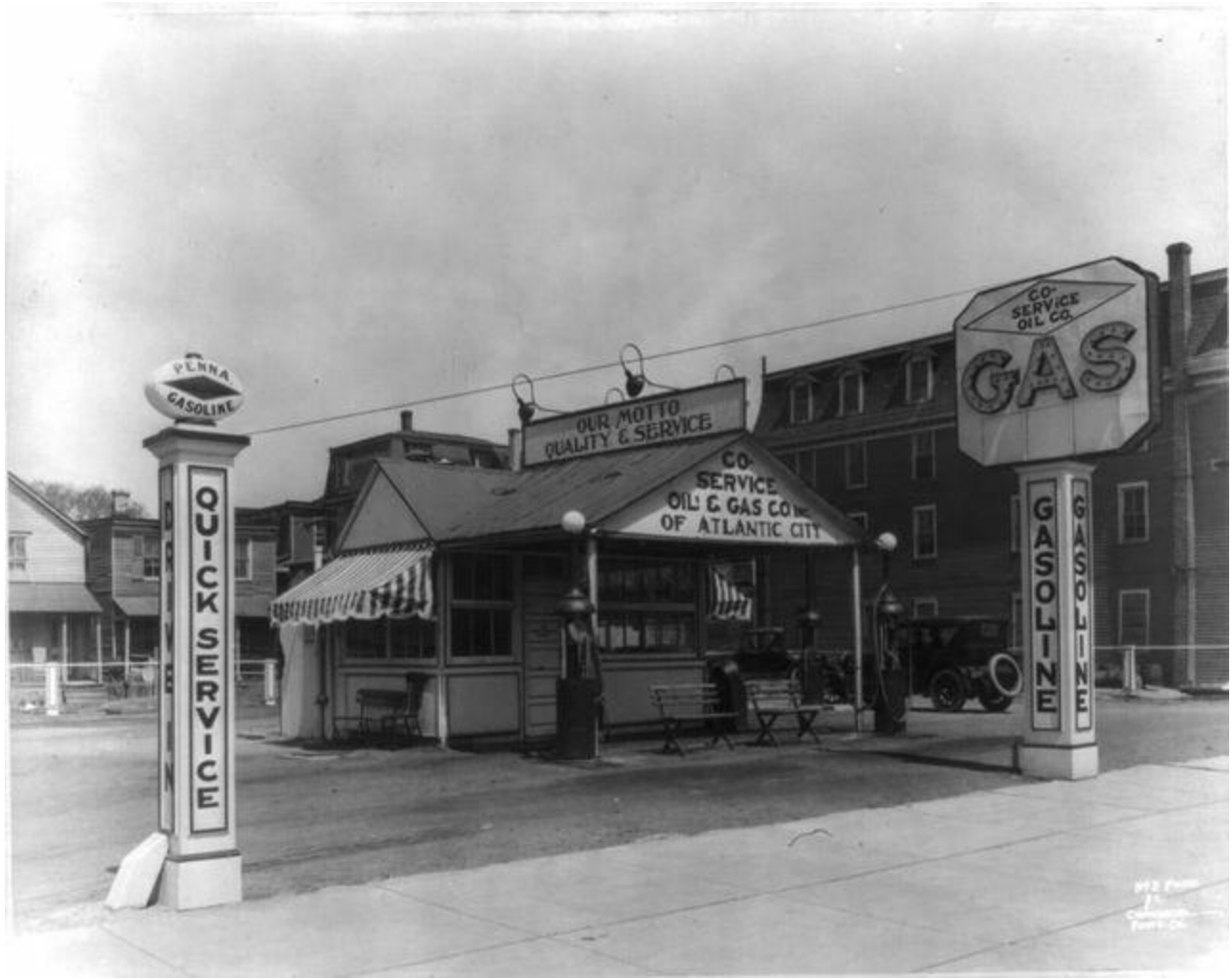
Atlantic City - year Unknown