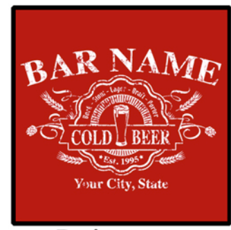
Design name: COLD BEER