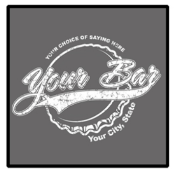
Design name: BOTTLECAP