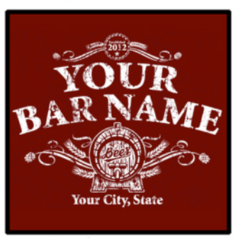
Design name: BEER KEG