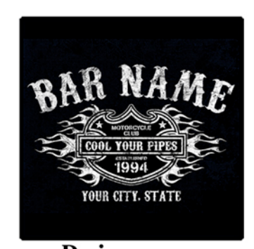
Design name: BIKER SHIELD