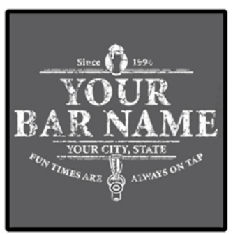
Design name: FUN ON TAP