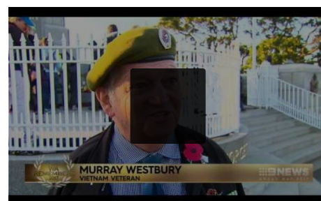
Nine News ANZAC Day 2017

While they recognise the importance of, and respect the participation of next-of-kin (NOK), they request the following