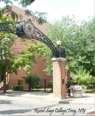
Russel Sage College, Troy, NY