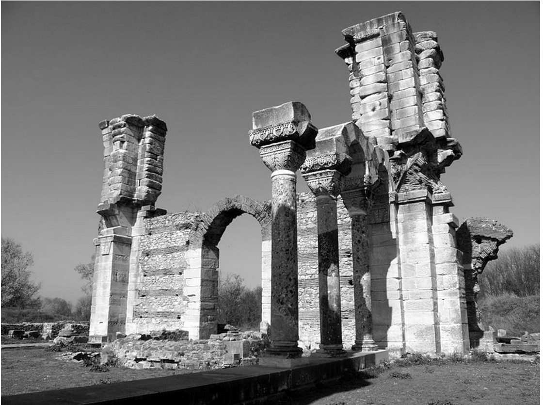
Ruin of a church at Philippi

May 22, 2022 8:30 AM Sixth Sunday of Easter