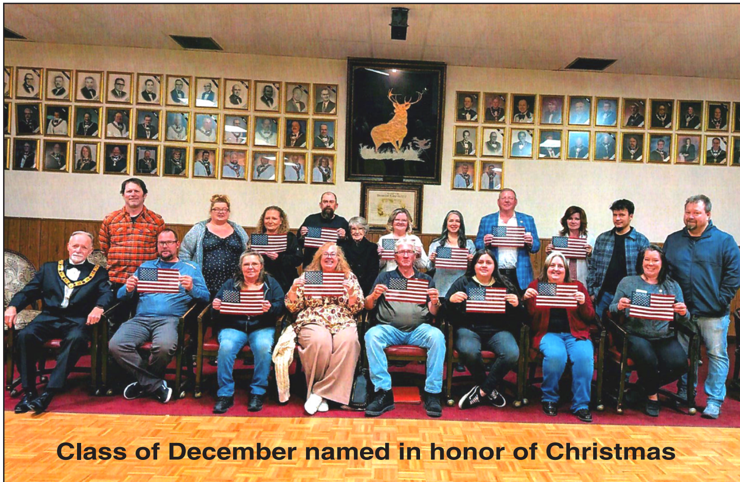
Class of December named in honor of Christmas