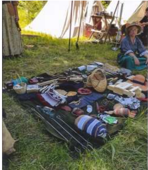
Prizes on the Blanket

getting the supplies for all the activities and also in getting many prizes. All children walked away from the blanket drawing with at least 3 prizes.