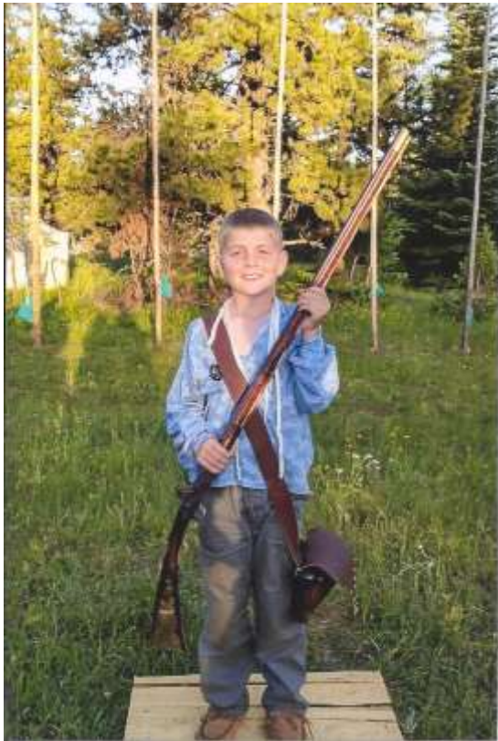
The lucky winner of the rifle

The youth grant from WSMA helped greatly in