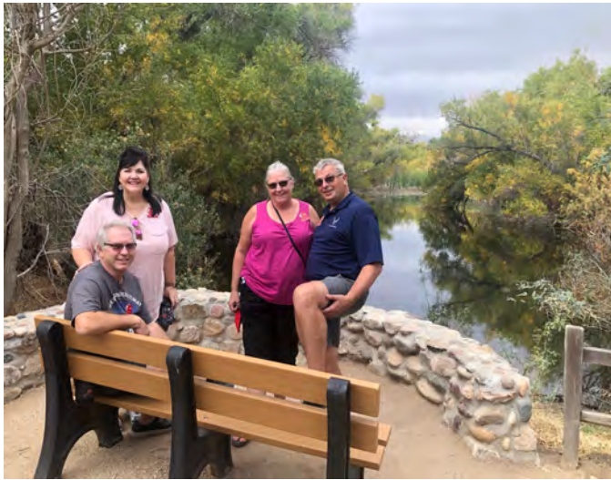
headed to the Hassayampa River Preserve. The Hassayampa River Preserve is a 770-acre riparian nature reserve owned by The Nature Conservancy of Arizona,