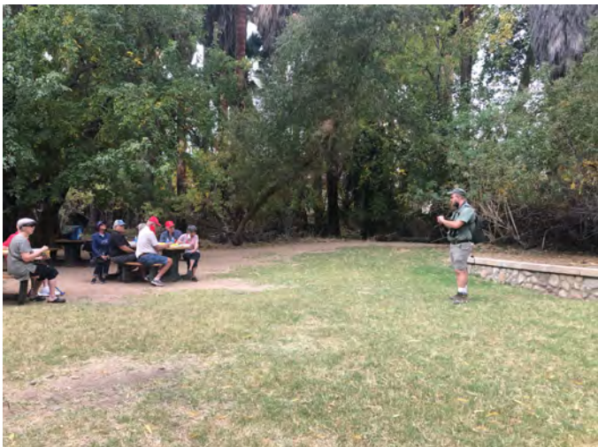
near Wickenburg. The Hassayampa River has mostly subterranean flows for most of its 113 miles (182 km) length, the stretch contained within the preserve has year-round flowing water. The preserve is in the Sonoran Desert, which contain one of the most rare and threatened