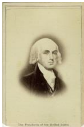
James Madison (1751-1836)

With the war starting badly for America, the Federalists hope to throw Madison out of office.