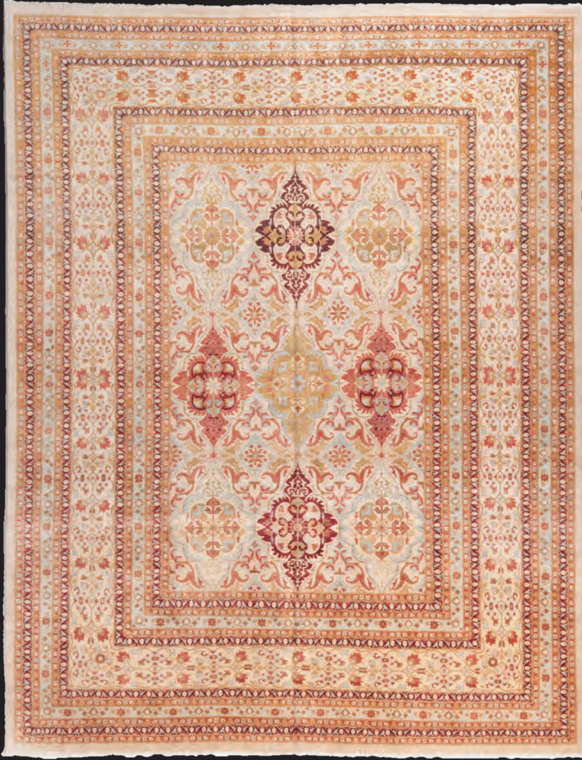
Pakistani Kermanshah Wool Size: 15'7" x 12'