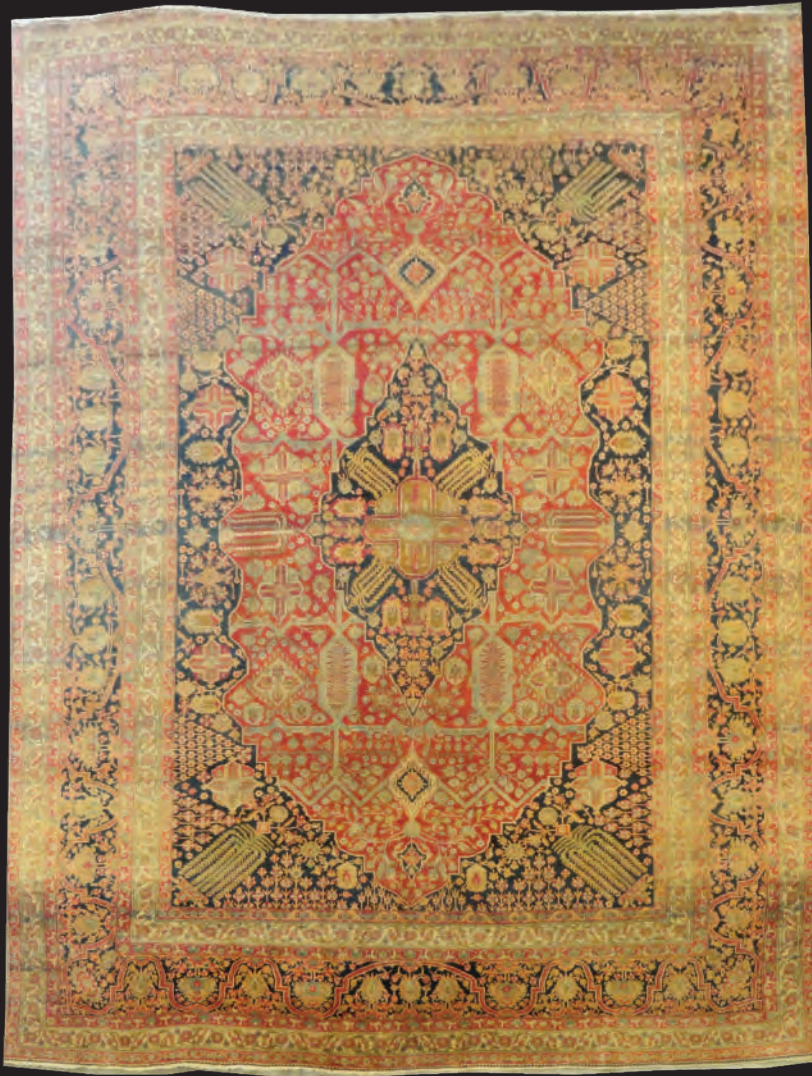
Persian Antique Kashan Mohtasham Hand Woven in Iran - Ca. 1880 Size: 12'6" x 9'4"