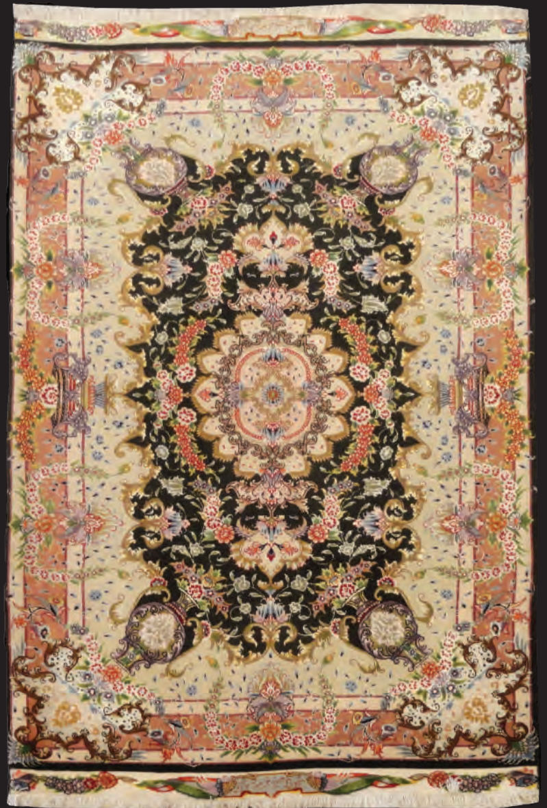
Persian Tabriz Signed by: Jafari-Bishak Silk and Wool Size: 5'9" x 3'4"