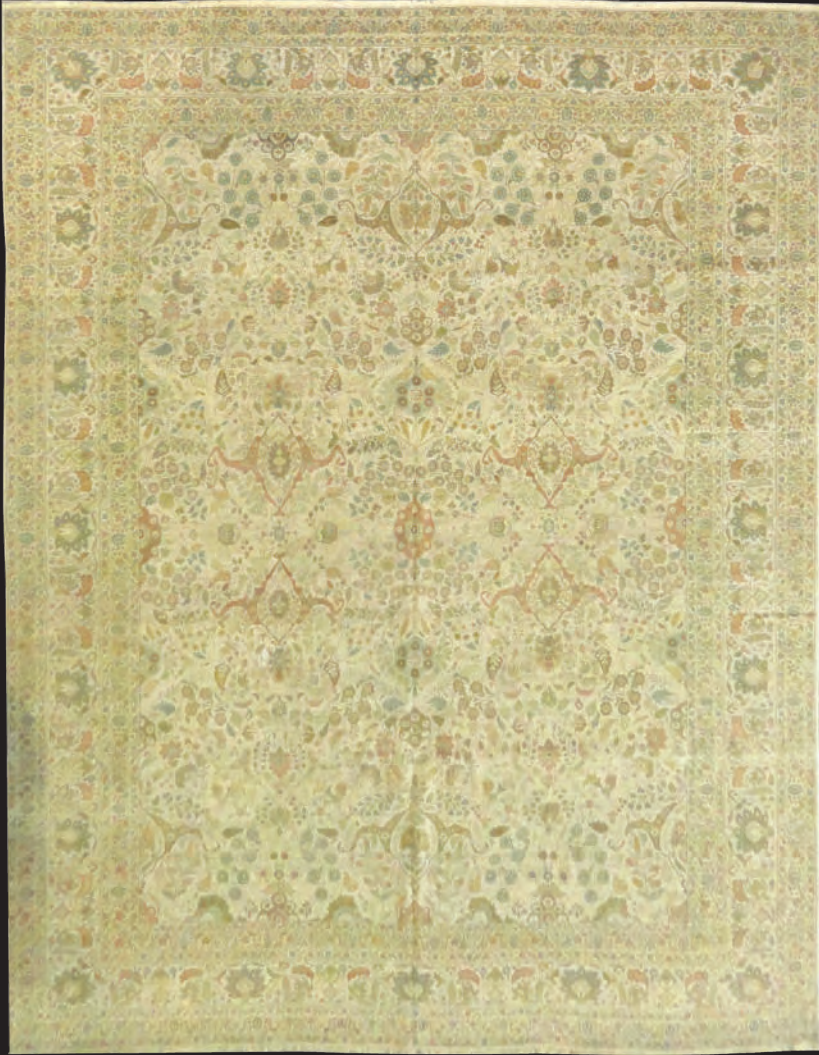
Pakistani Hadji Jalili Wool Size: 16' x 12'