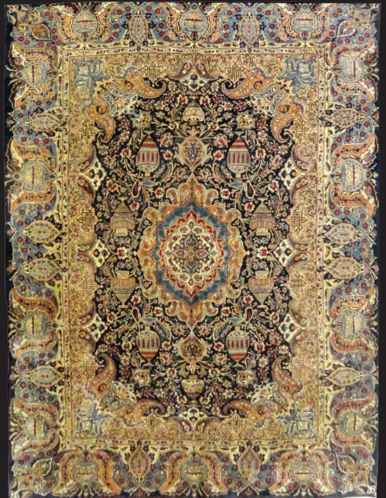
Persian Pictorial Kashmar Wool Size: 12'10" x 10'