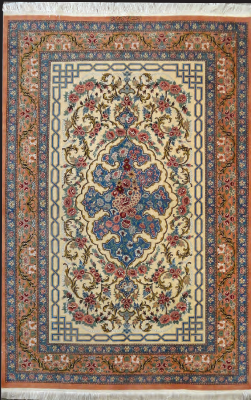
Persian Qum Signed by: Arami 100% Silk Size: 6'5" x 4'6"