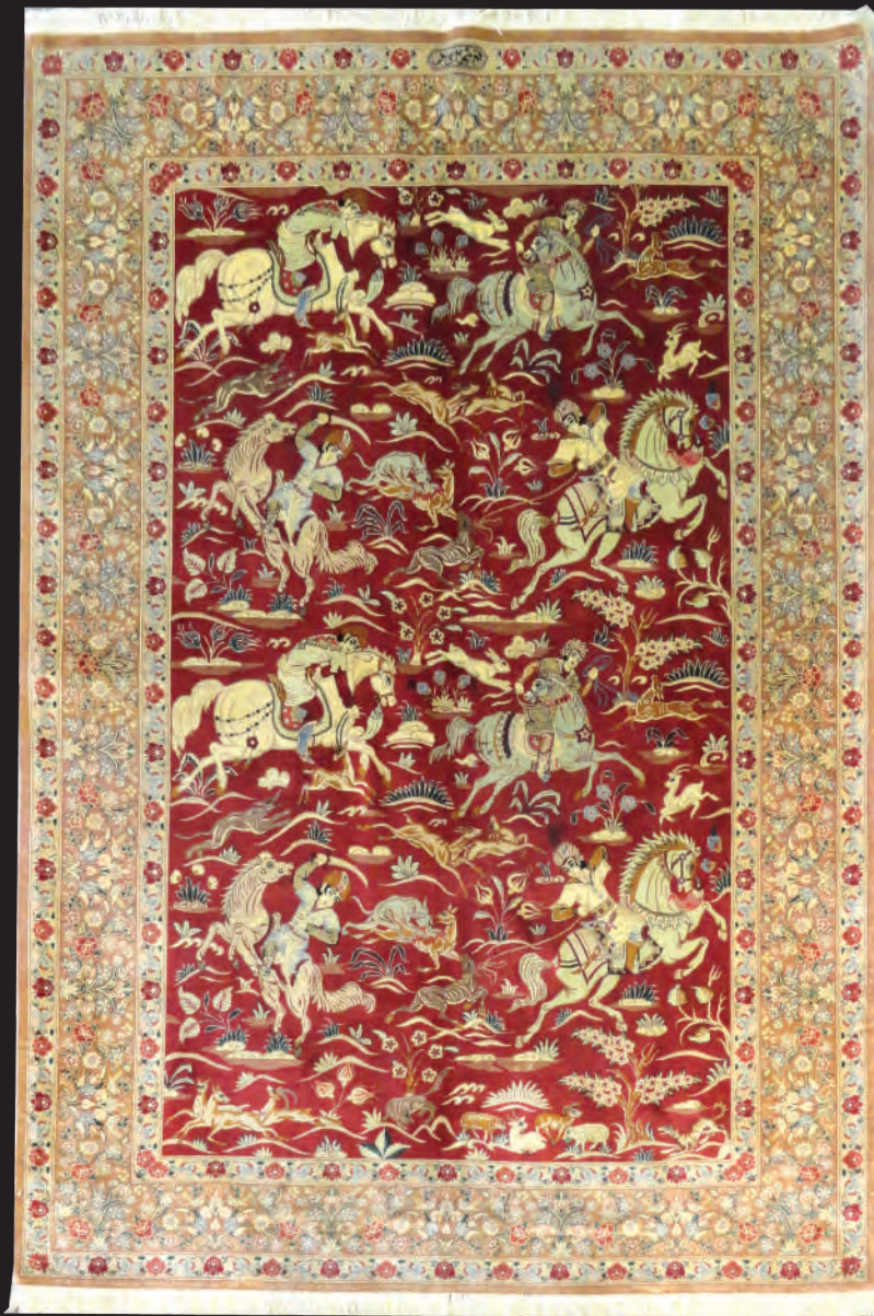
Persian Qum Signed by: Shojahifar 100% Silk Size: 6'7" x 4'6"