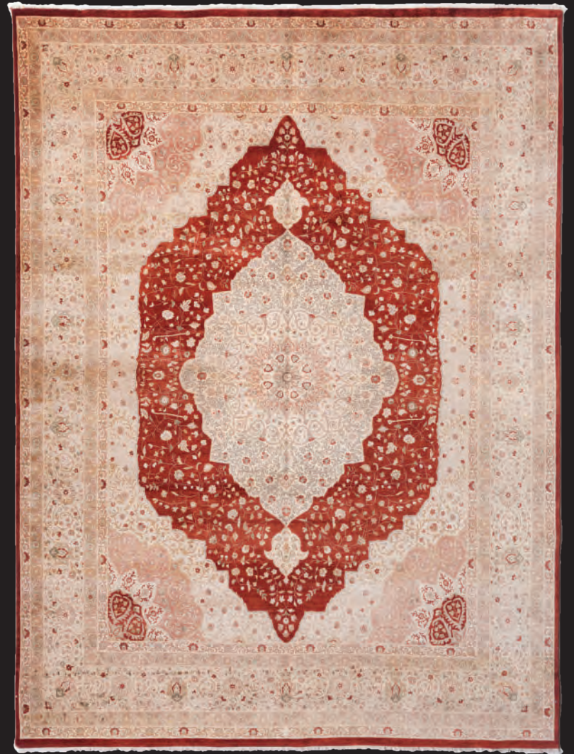
Pakistani Hadji Jalili Wool Size: 11' x 8'2"