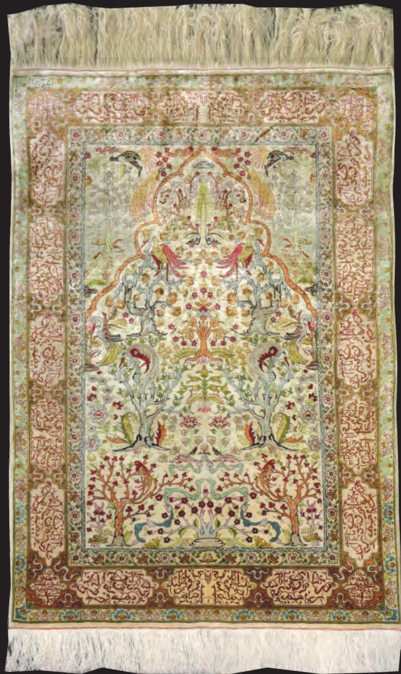
Turkish Signed by: Hereke 100% Silk Size: 5'2" x 3'3"