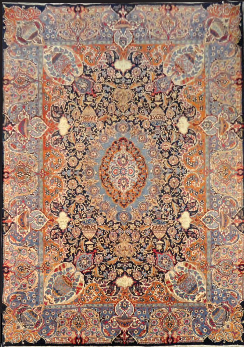
Persian Pictorial Kashmar Wool Size: 12'9" x 9'9"