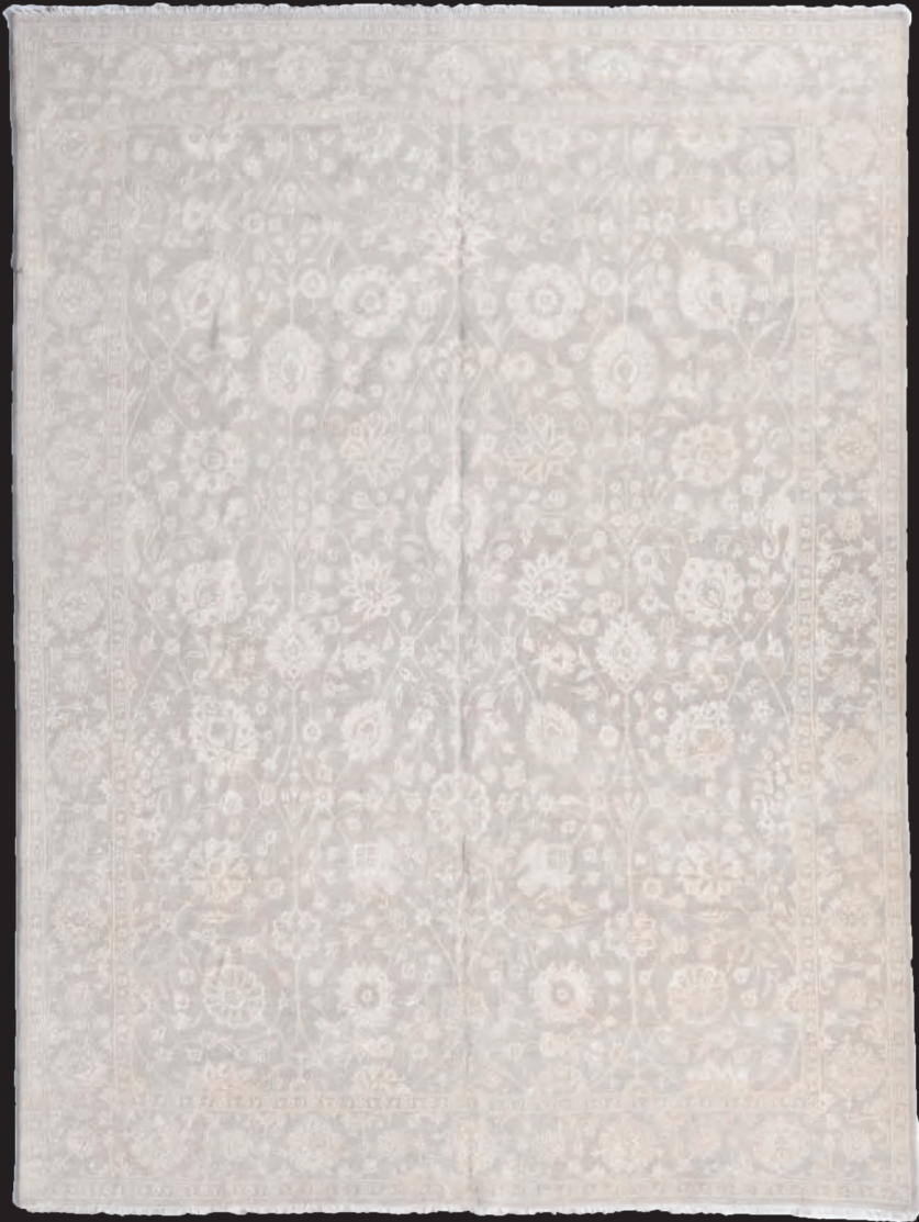
Pakistani Oushak Silk and Wool Size: 12' x 9'