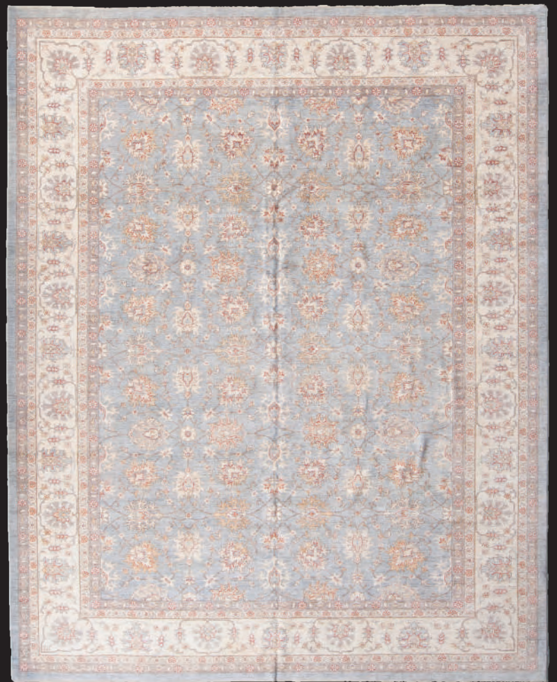
Pakistani Oushak Wool Size: 14'6" x 11'8"