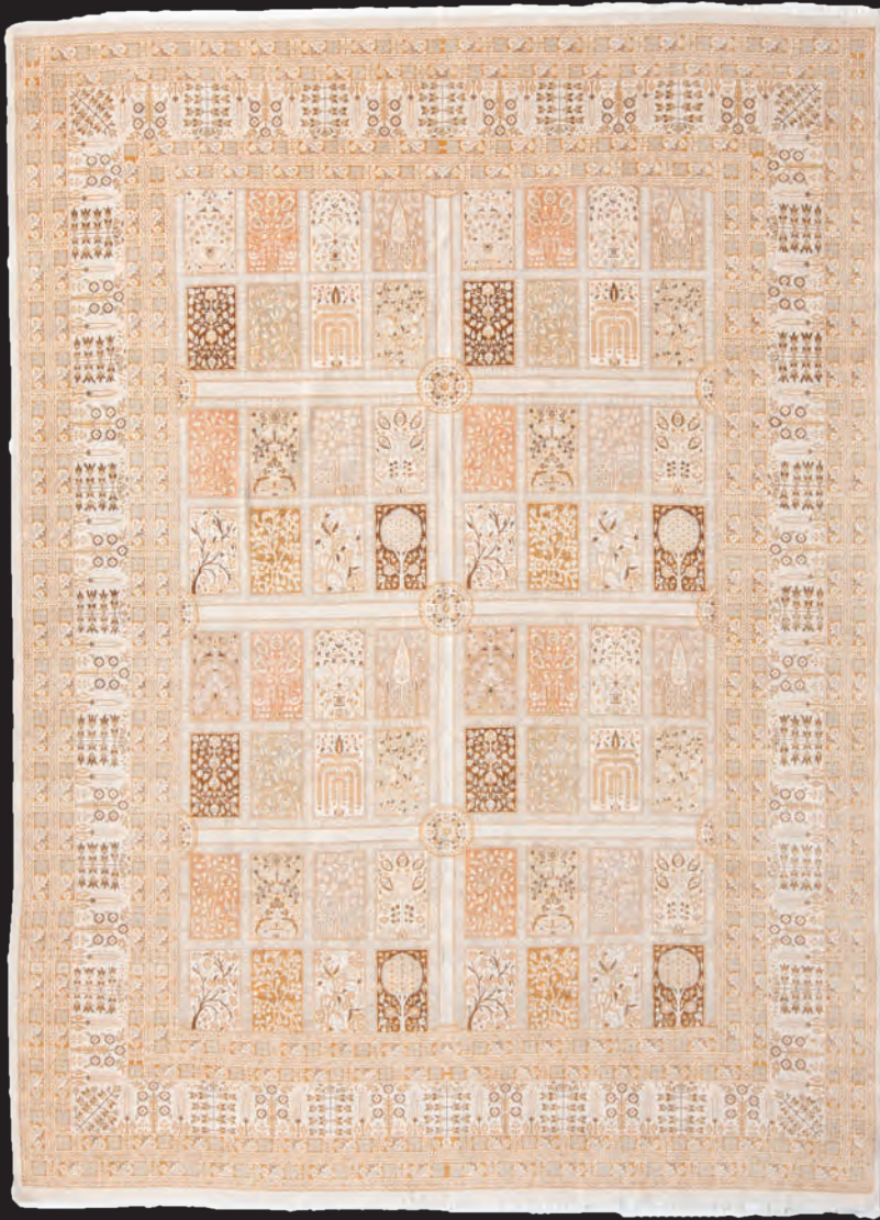
Pakistani Four Season Design