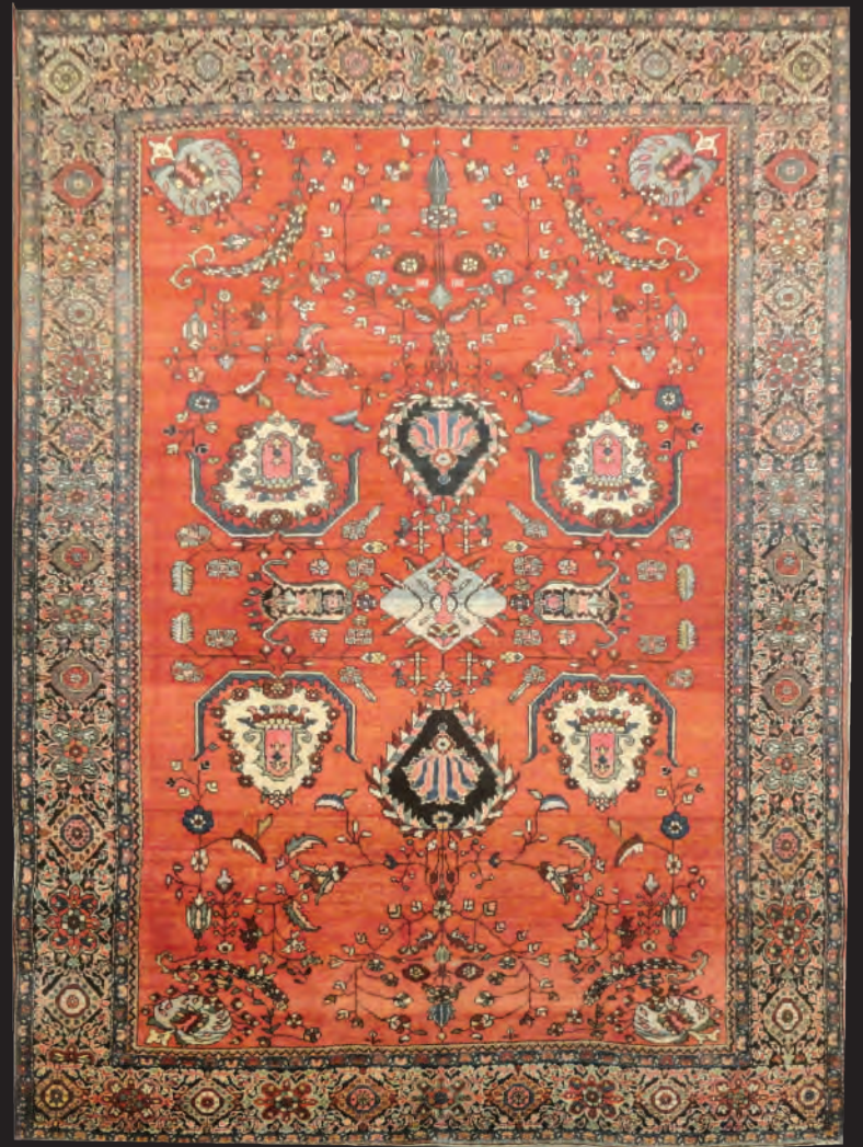
Persian Antique Sarouk Farahan - Ca. Early 1900's Size: 6'5" x 4'2"