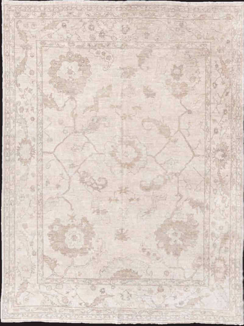
Turkish Oushak Angora Wool Size: 11'10" x 9'10"