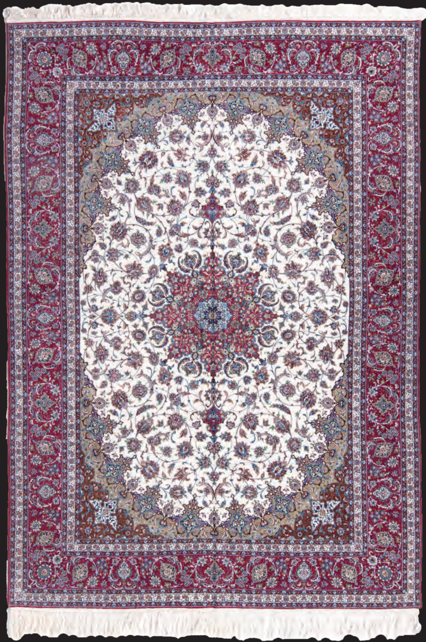
Persian Esfahan Silk and Wool Size: 13'10" x 9'9"