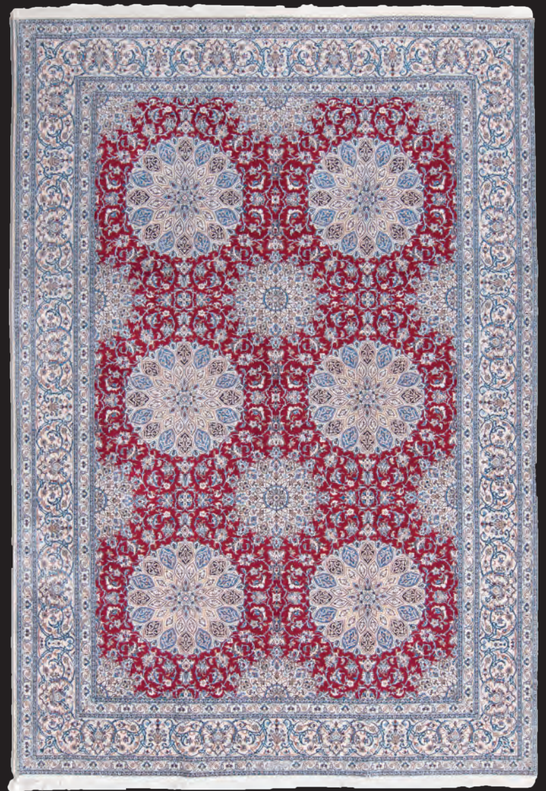
Persian Nain Signed by: Habibian Silk and Wool Size: 10'4" x 7'1"