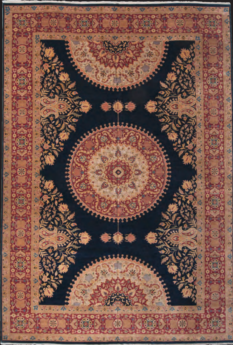
Fine India Farahan Sarouk Wool - Embassy Size Size: 19'8" x 13'2"