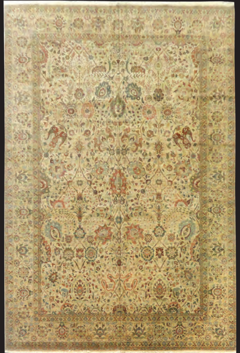
Pakistani Hadji Jalili Wool Size: 15'4" x 10'3"