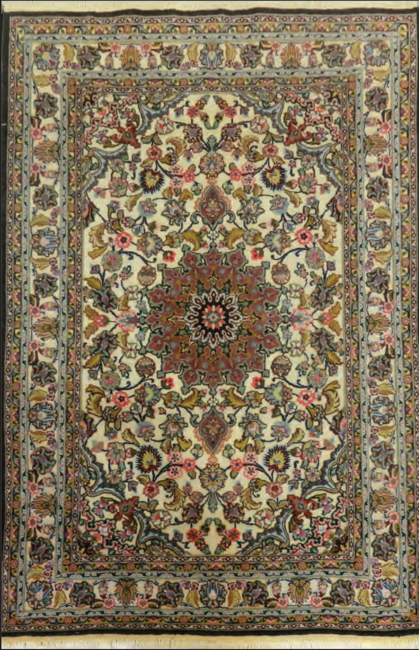
Persian Tabriz Suff Gold Thread, Silk and Wool Size: 5' x 3'3"