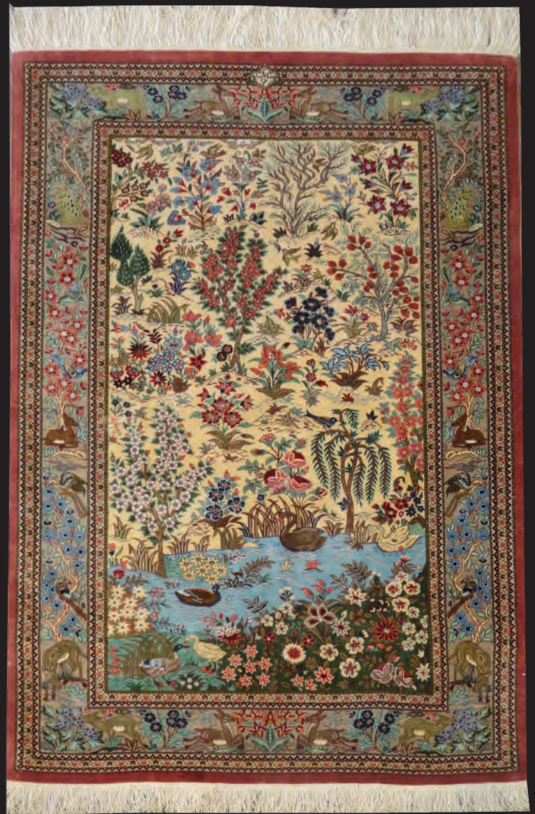
Persian Qum Silk Signed by: Reza Erami Size: 5'2" x 3'4"