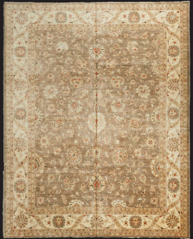
Pakistani Oushak Wool Size: 14'9" x 12'