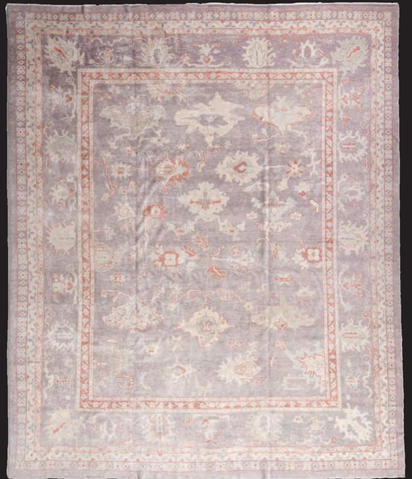
Turkish Oushak Angora Wool Size: 15' x 12'4"