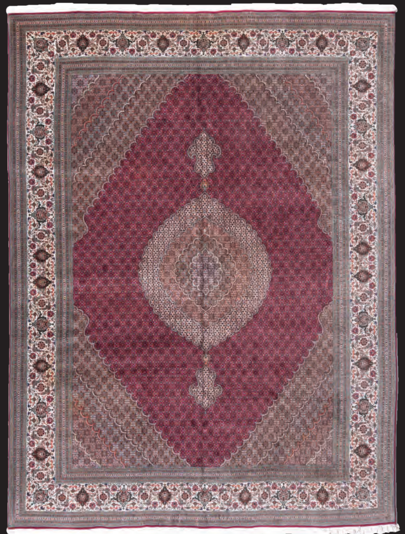
Persian Tabriz Mahi Silk and Wool Size: 13'1" x 10'