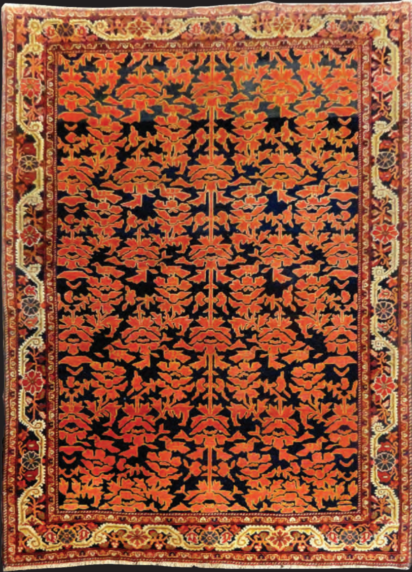
Armenian Antique Farahan Wool - Ca. Late 1900's Size: 5'1" x 3'8"