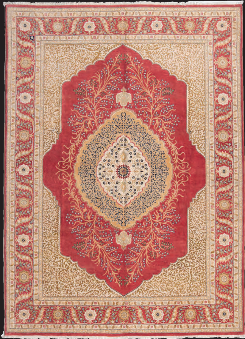
Pakistani Hadji Jalili Wool Size: 12'3" x 9'2"