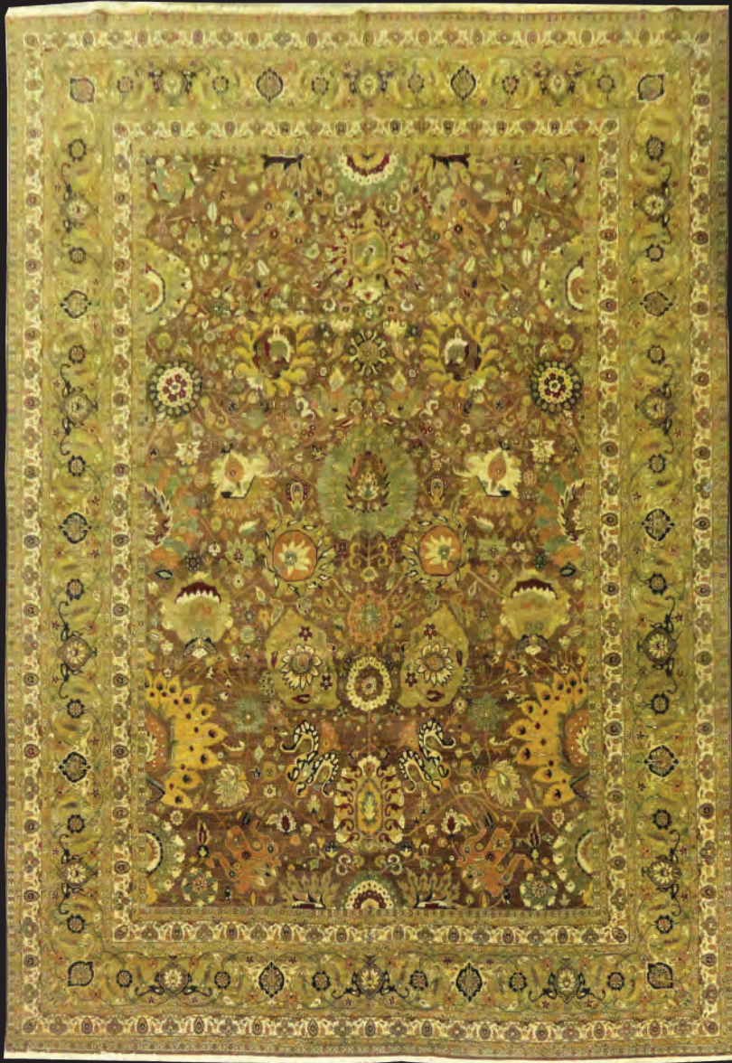
Pakistani Hadji Jalili Wool Size: 14'2" x 11'3"