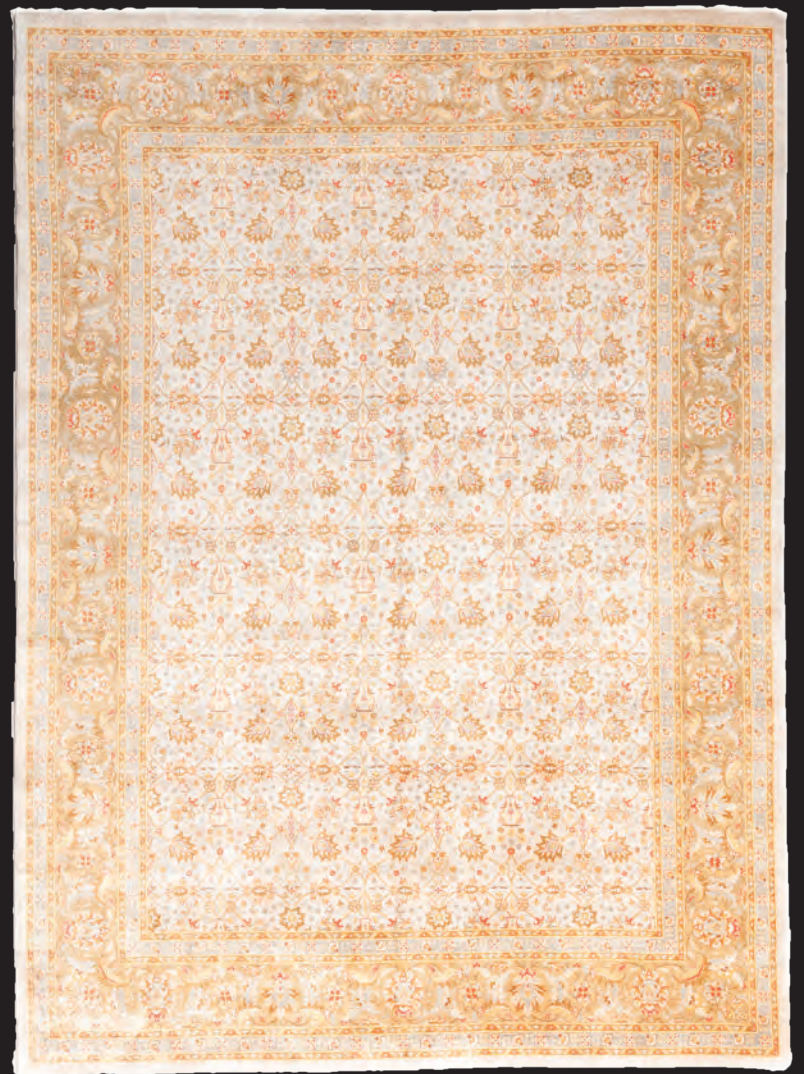
Pakistani Sultanabab Wool Size: 12'6" x 9'2"