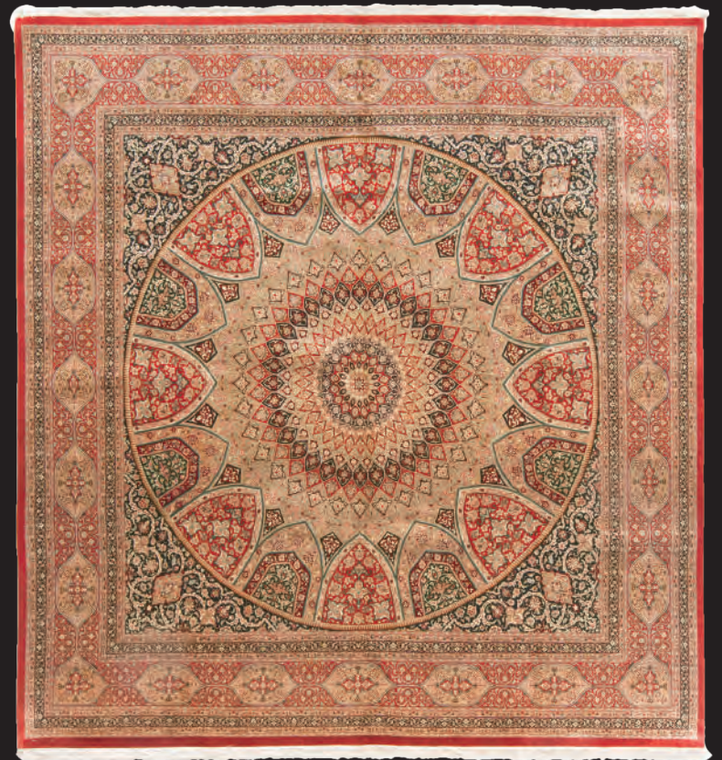
Persian Qum Mosque 100% Silk - Square Size: 10' x 10'