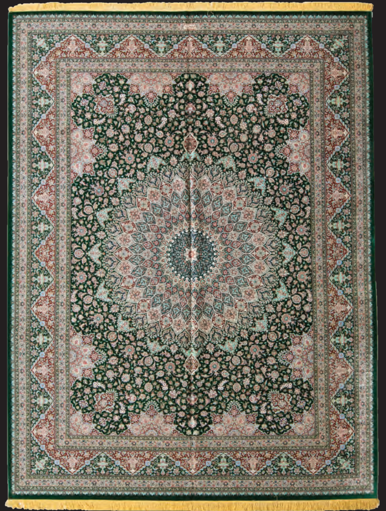
Persian Qum Signed by: Abbassian 100% Silk Size: 13' x 9'9"