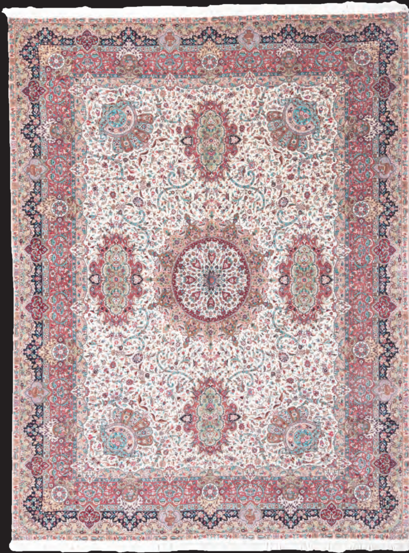
Fine Pakistani Tabriz Wool Size: 12'3" x 9'2"