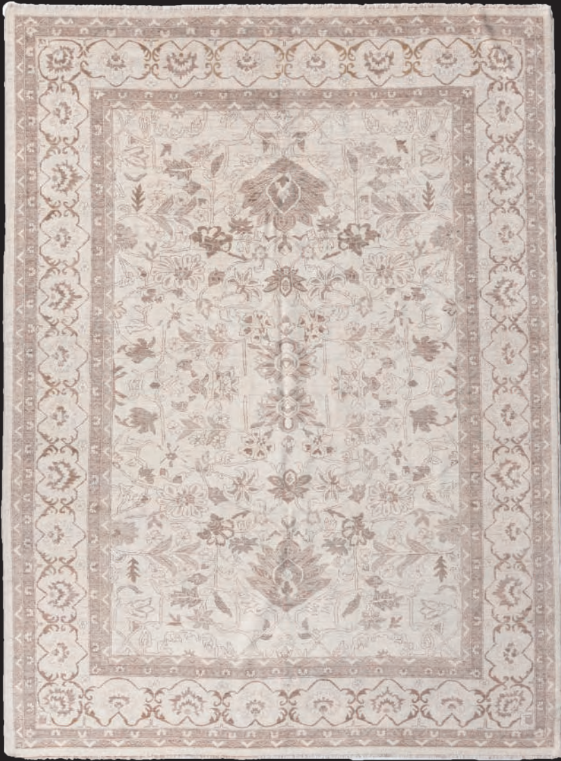
Pakistani Oushak Wool Size: 12'6" x 9'6"