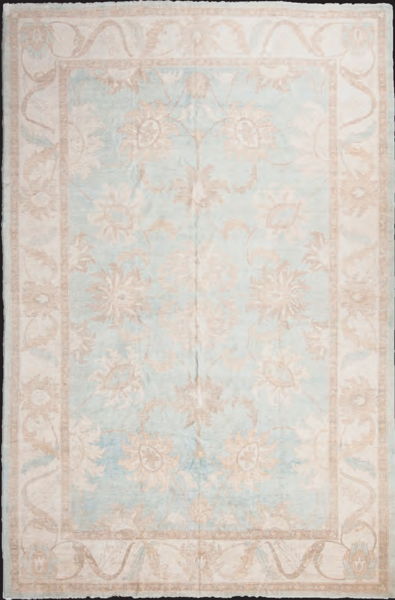
Pakistani Fine Oushak Wool - Embassy Size Size: 19'3" x 13'1"