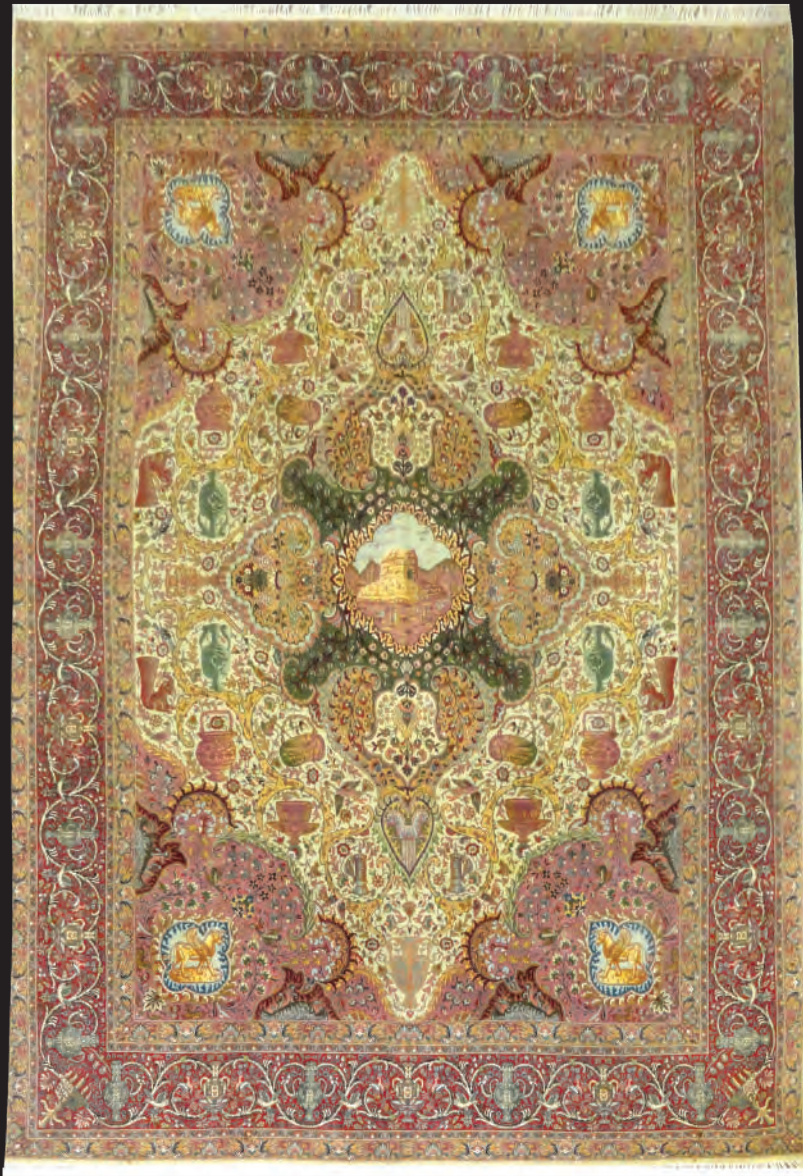
Persian Tabriz Nezam Hand Woven in Iran - Ca. 1950 Size: 12'10" x 9'10"