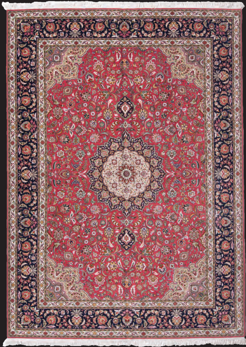
Very Fine Persian Tabriz Javad Ghalam Silk and Wool Size: 11'6" x 8'2"