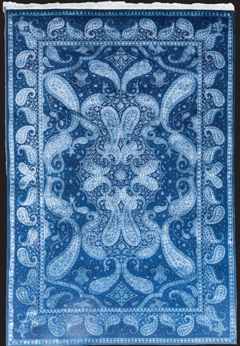
Fine India Boteh Silk and Wool Size: 8'3" x 5'3"