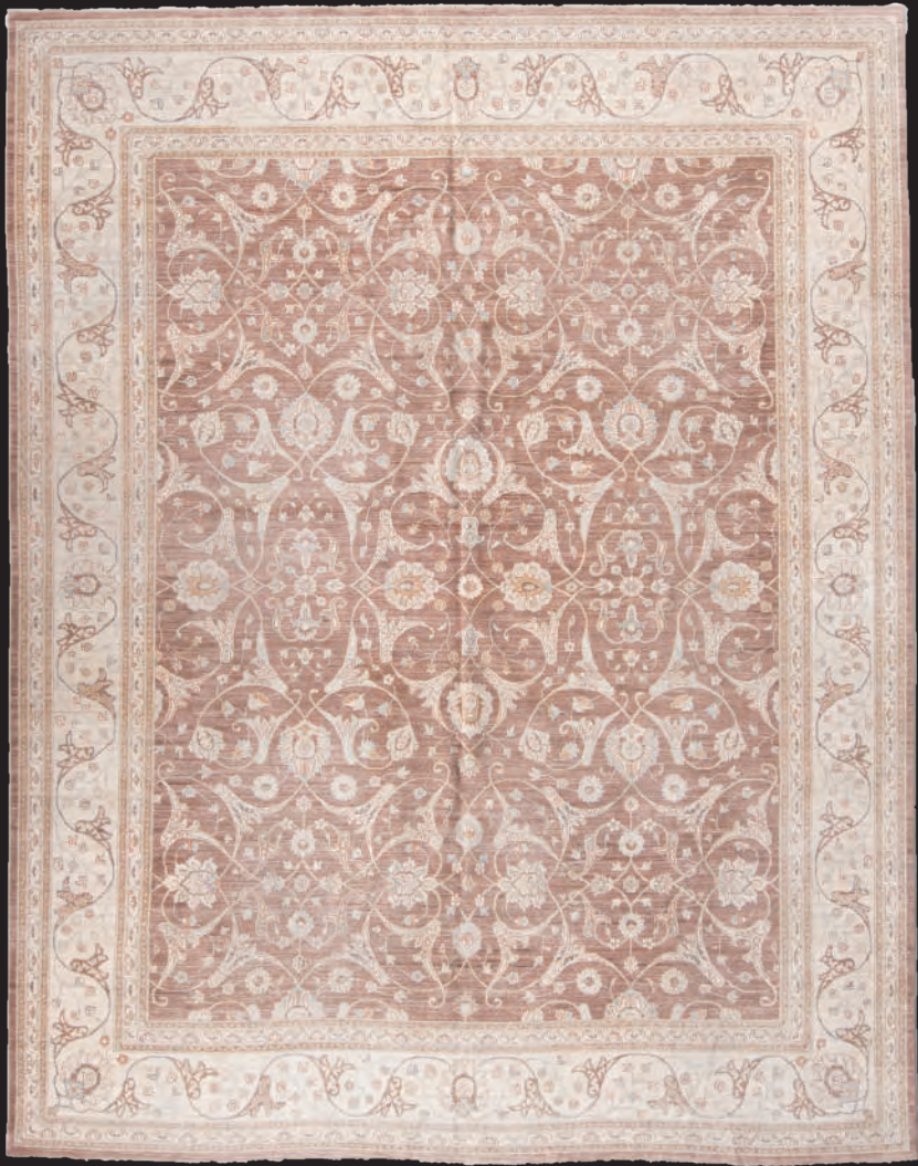
Pakistani Oushak Wool Size: 15' x 12'