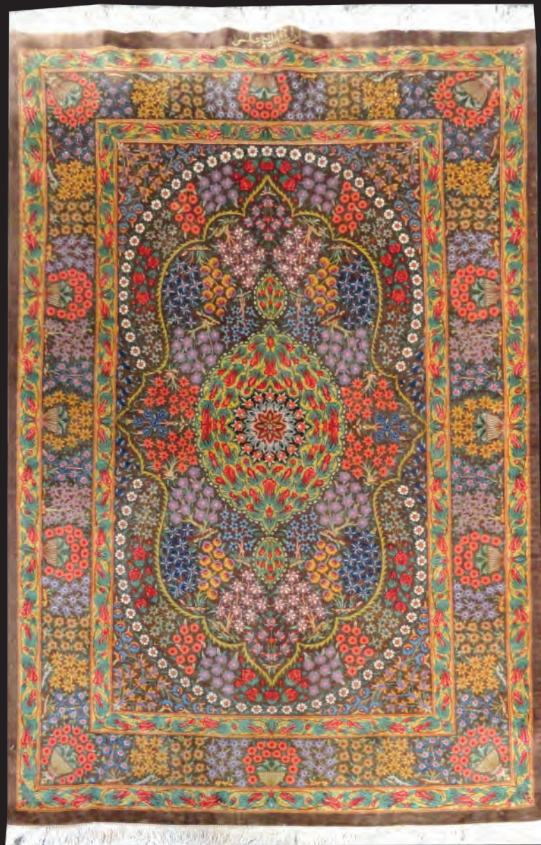
Persian Qum Signed by: Abbassi 100% Silk Size: 5' x 3'3"