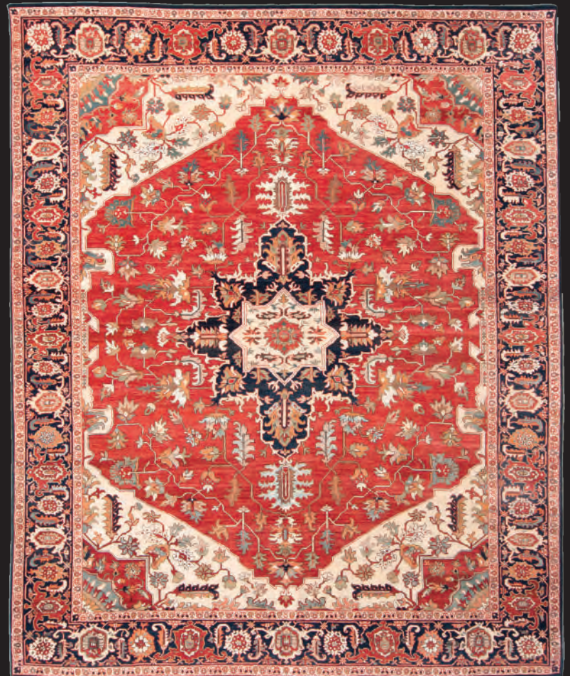
India Heriz Serapi Wool - Vegetable Dyes Size: 9'2" x 11'2"