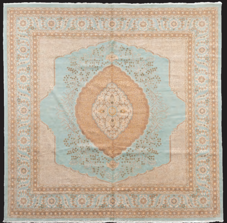
Pakistani Hadji Jalili Wool - Square Size: 12'1" x 12'1"