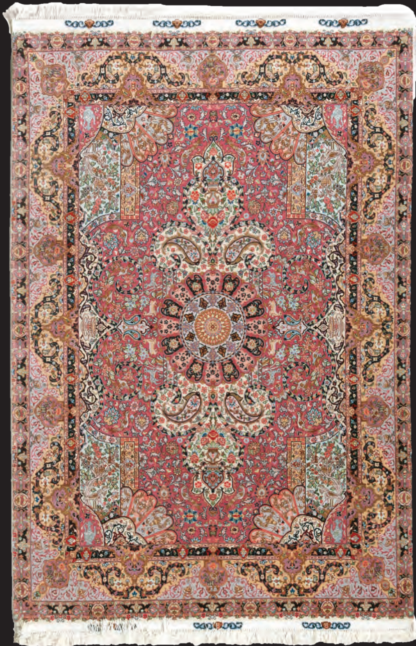
Very Fine Persian Tabriz Nezam Silk and Wool Size: 6'7" x 5'