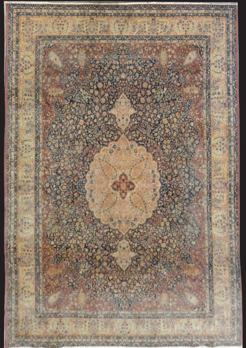
Persian Antique, Kermanshah Hand Woven in Iran - Ca. 1880 Size: 12'3" x 8'8"