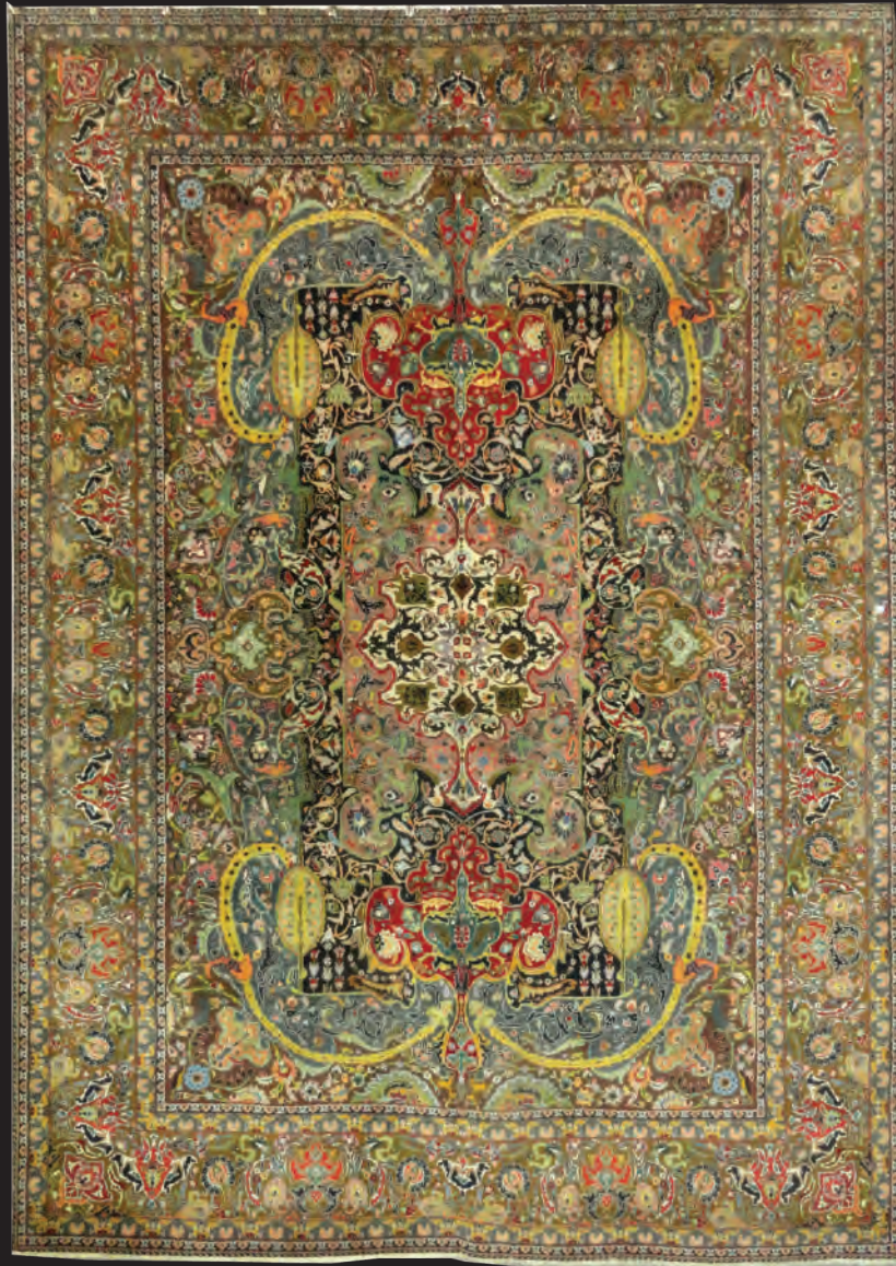
Persian Tabriz Gallett Wool Size: 11'1" x 8'2"