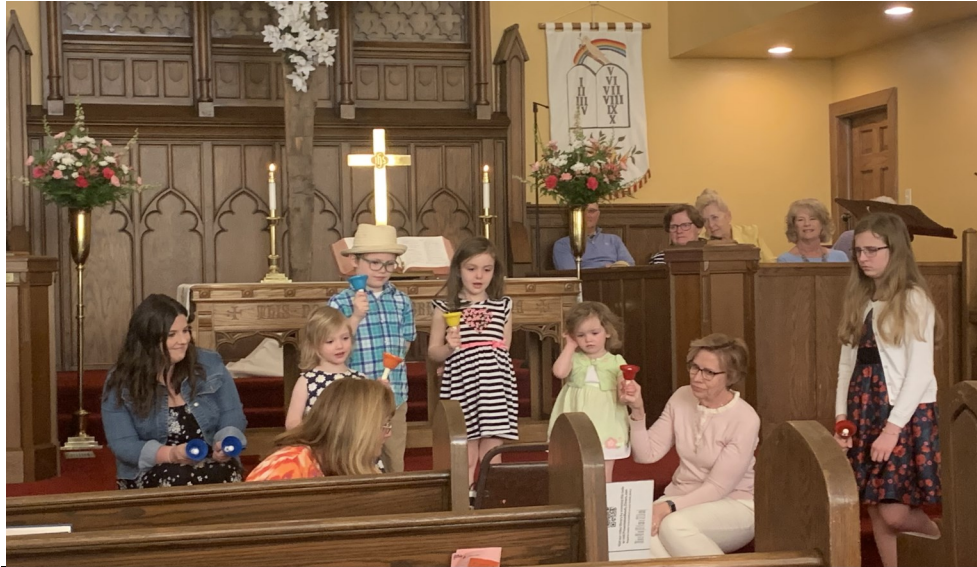
Mother's Day Cuties!!