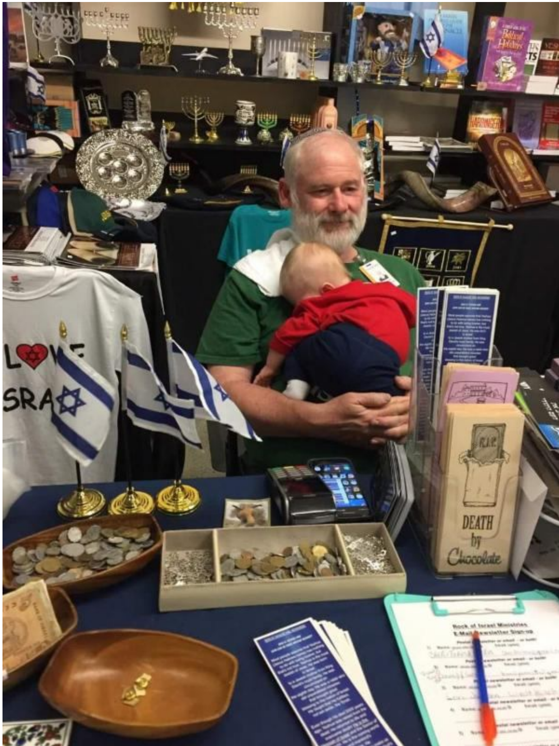
Pictured also is a young MAN using one of our t-shirts to preach in at a church in Fort Worth, Texas!