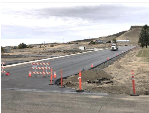
W 3rd Street Entry from Main Street