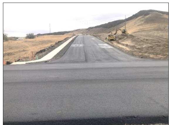
W 2nd Street uphill to new cul-de-sac