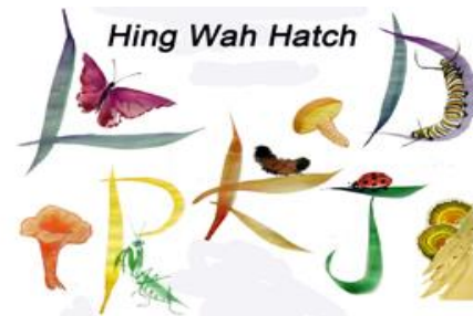
Chinese Brush Strokes

Springfield Art Museum Community Room1111 Brookside Dr.