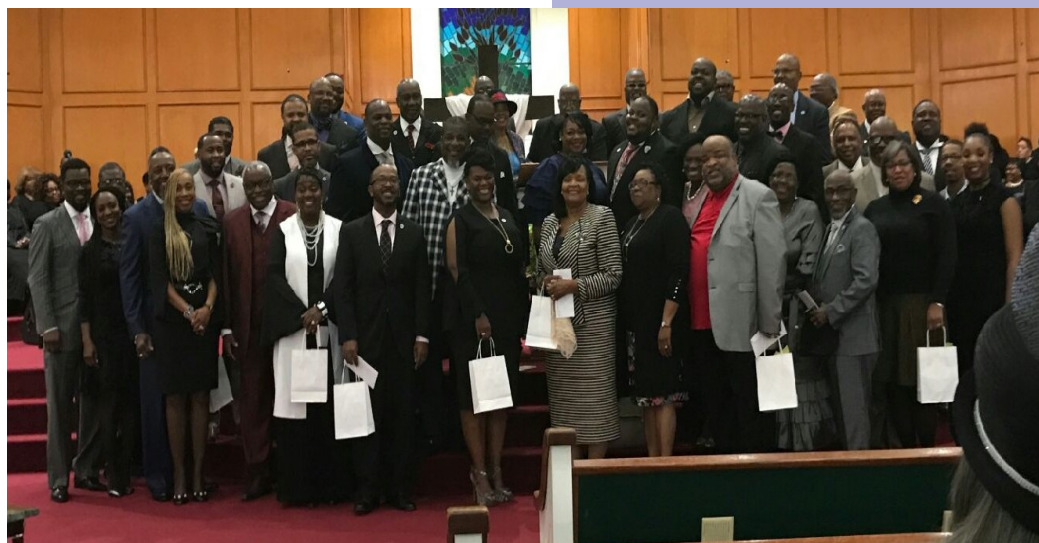
Pictured Below: Persons who received the hurricane relief funding in Houston, Texas