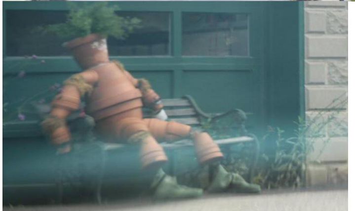
This guy really went to pot (Couldn't resist)