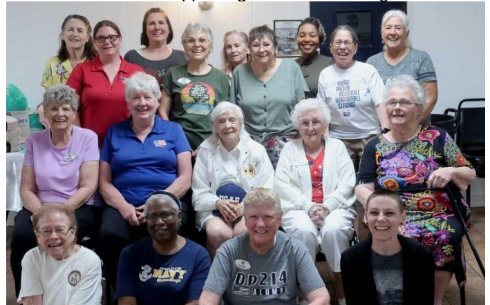
Attendees at the annual baby shower. Names were not provided.

We enjoyed guessing the gestation period for multiple animals; different types of feces or ‘scat’ for various animals, and making as many words as possible out of the letters in “maternity”. Prizes were given to the winner of each category and members enjoyed having this time to gather for a common mission supporting other veteran organizations.