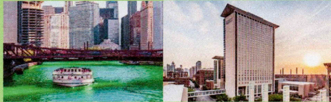
Watch The City Go Green- Hotel Hyatt Regency Convention Center McCormick Place

All Roads Lead to Chicago July 20-23, 2025