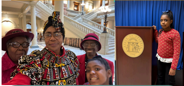
Georgia's Legislative Session for Sick Cell Funding & Research