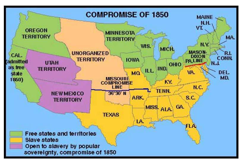
The U.S. House Passes Douglas's Nebraska Territorial Bill

Map Showing The "Unorganized Territory" (Beige) In 1850