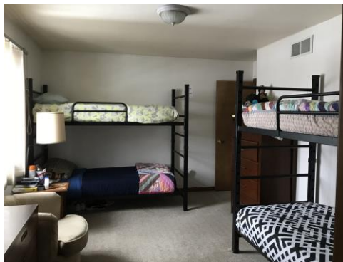
Bedrooms and living area