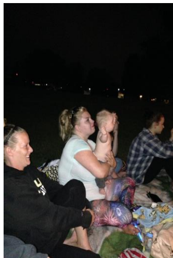
Home Safe 2017