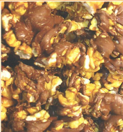
Milk Chocolate Caramel