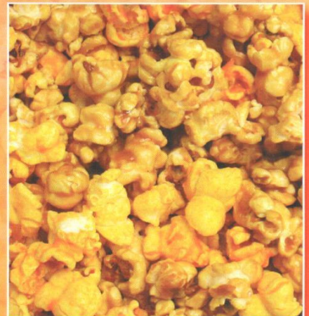
Chicago Mix (Cheese and Caramel mixed)