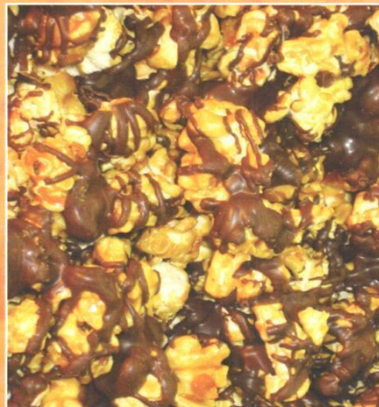
Dark Chocolate Caramel