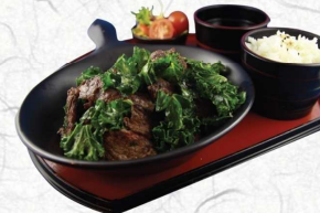
Wafu Steak Set