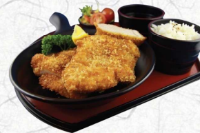
Pork Katsu Set