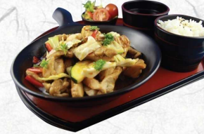
Chicken Teriyaki Set