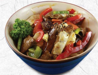
Wagyu Beef Don