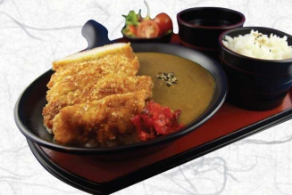
Pork Katsu Curry