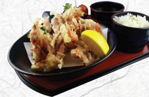
Soft Shell Crab Set