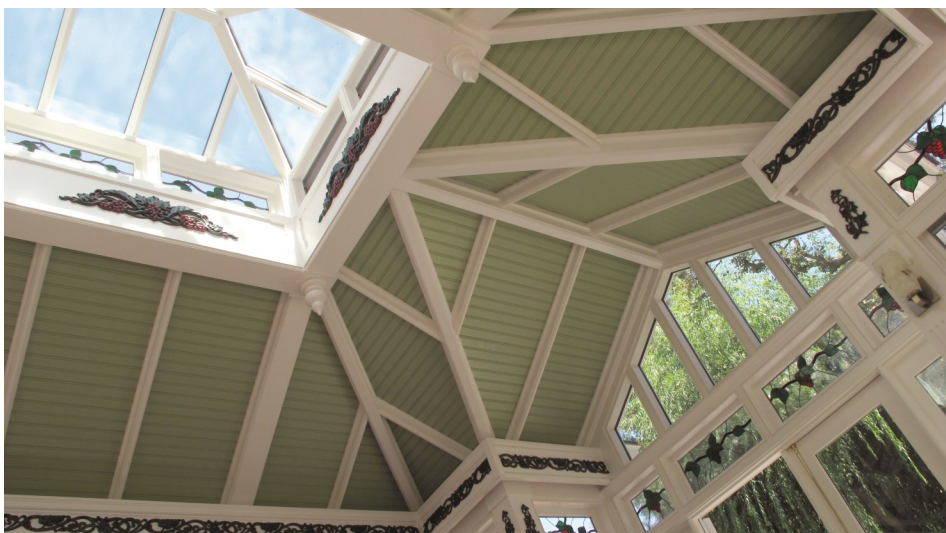
Custom hipped skylight with clerestory windows

Our Design Professional's will collaborate with you, the contractor, to design and manufacture a skylight system that will fit your project to the exact specifications you provide!