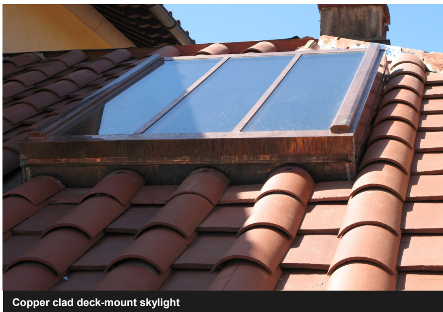
Copper clad deck-mount skylight