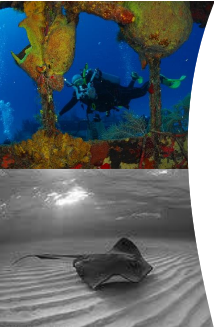
CAYMAN ISLANDS, B.W.I. GRAND CAYMAN · LITTLE CAYMAN · CAYMAN BRAC