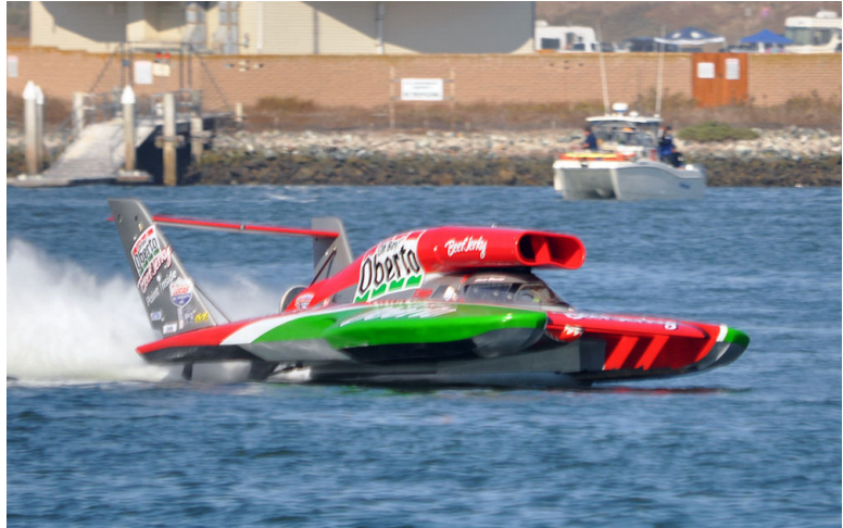
Karl Pearson photo

In 2A, Degree was in lane 1, with Formula in 2, TapouT in 3, Valken in 4, and Qatar in 5. A second straight lane 5 draw had owner Erik Ellstrom kidding by asking if there was something wrong with the #96 Ping-Pong ball. Formula again died in the backstretch before the start.