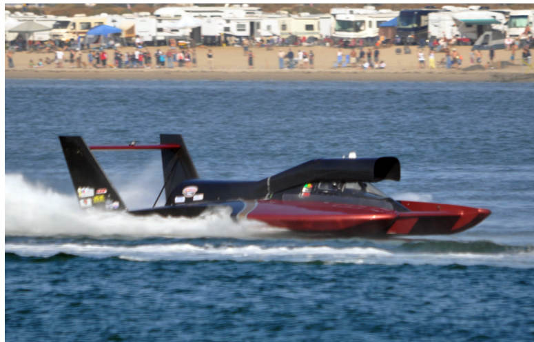
Greg Hopp returns with last seasons #9899, the boat he prefers over #9701 or the newest boat #0010, now a display for the Schumacher's.

While Villwock was on the course, Oberto was in the slings above the water. When Villwock's speed was