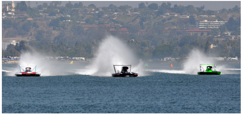
Karl Pearson photo

In 3B, Valken was in lane 1, with Graham in 2, and U-100 in 3. For the third consecutive heat, Qatar was drawn last, but Perkins chose lane 5 for TapouT , giving lane 4 to Villwock.