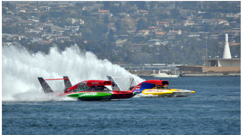
Karl Pearson photo