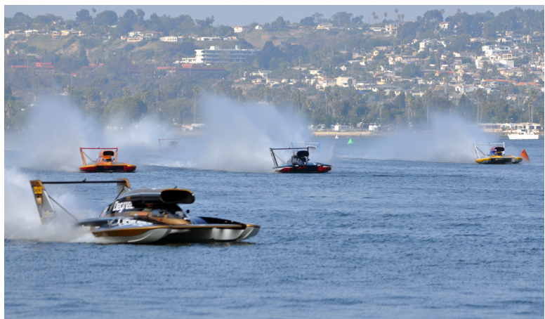
Karl Pearson photo