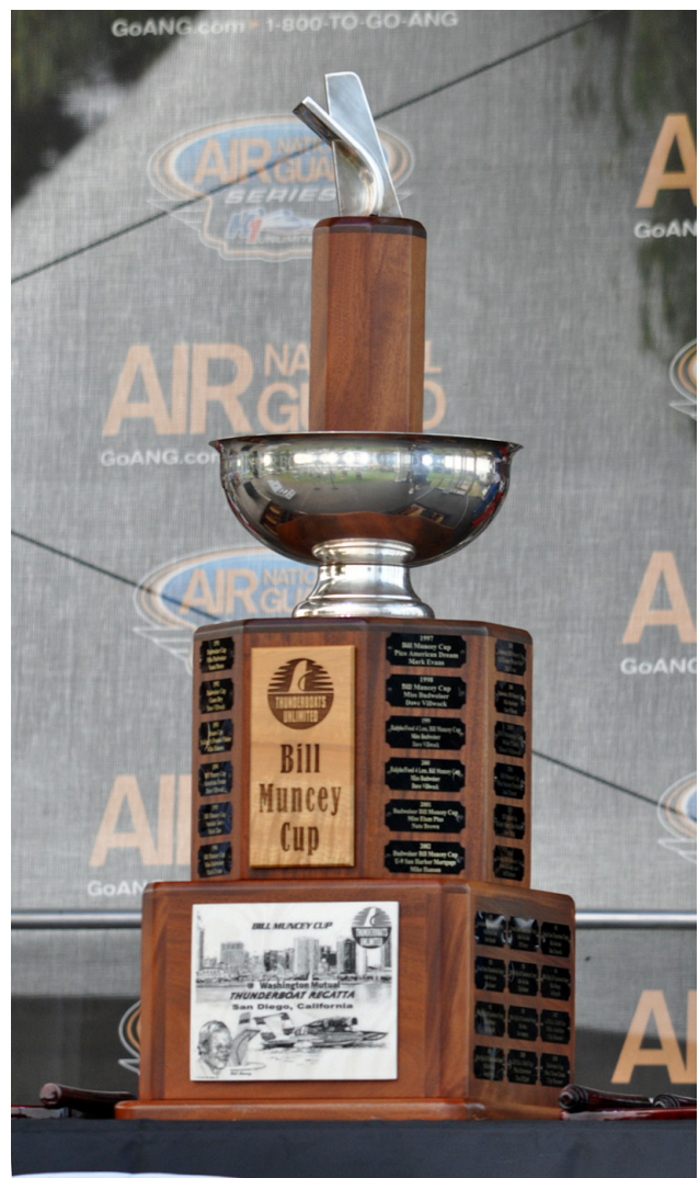
San Diego's coveted Bill Muncy Cup