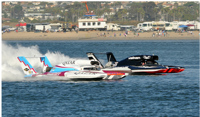
Karl Pearson photo