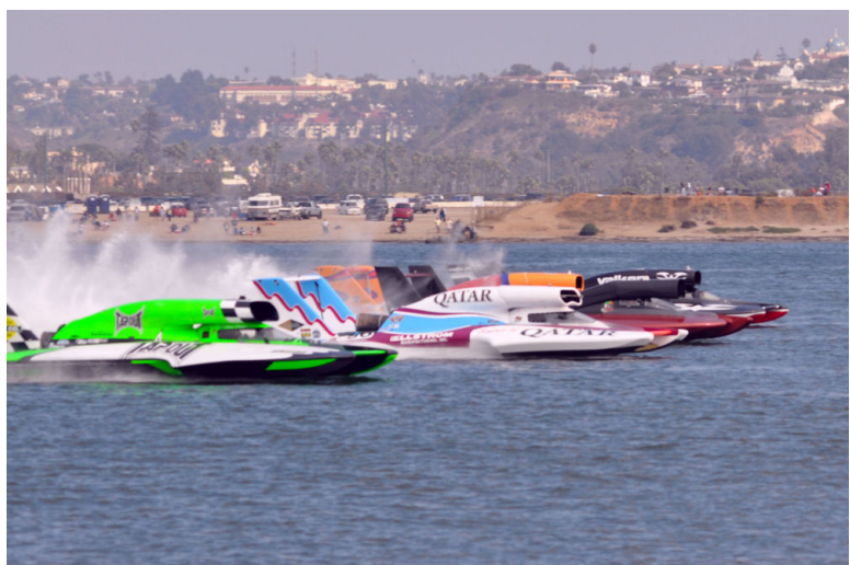
Karl Pearson photo