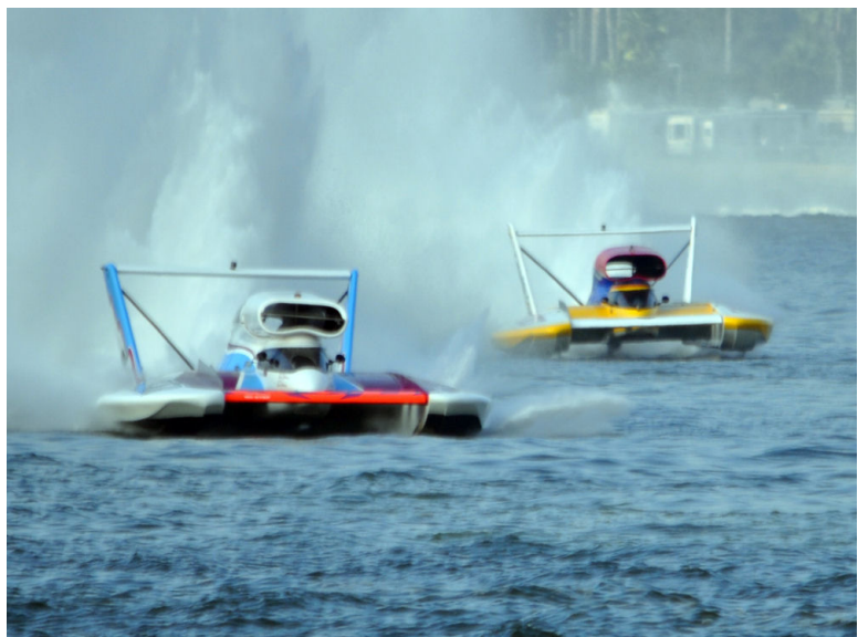
Karl Pearson photo