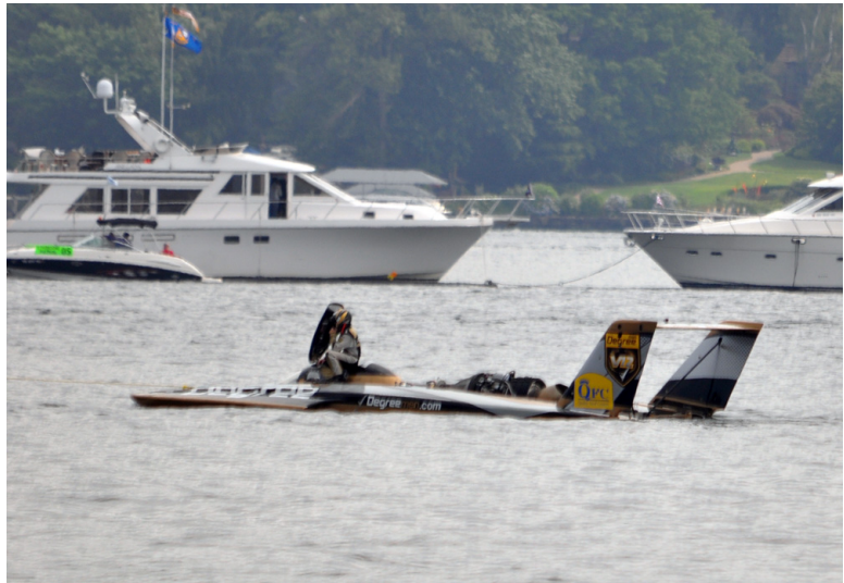
Karl Pearson photo