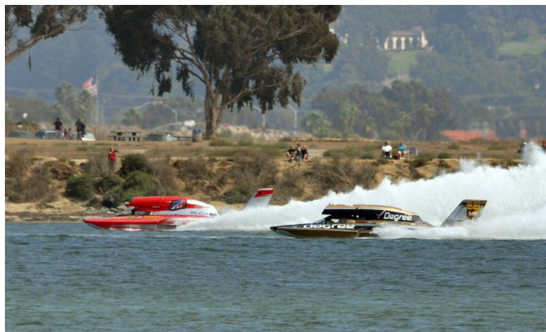
Karl Pearson photo