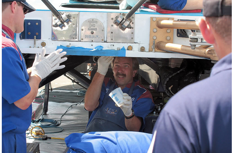
The two strut photos and top right photo from Brad Drake. Erick Ellstrom working on new strut photo by Lon Erickson