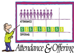
Attendance & Offering

Lutheran Disaster Response is collecting funds to help the recent Colorado Wildfire victims. Donations can be made using the "other" line on your envelopes or directly to Lutheran Disaster Response at 1-800-638-3522 or online at elca.org/disaster/ . Add the note "Colorado Wildfires" on your gift.