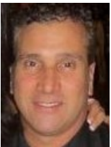
Sal Rea Construction 734-946-8730