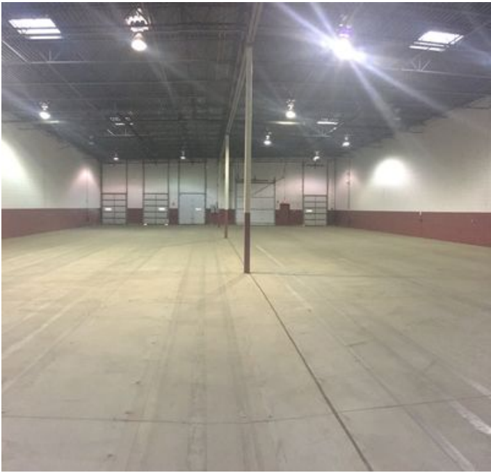
Ariport Business Center 11,220 sq.ft (2)