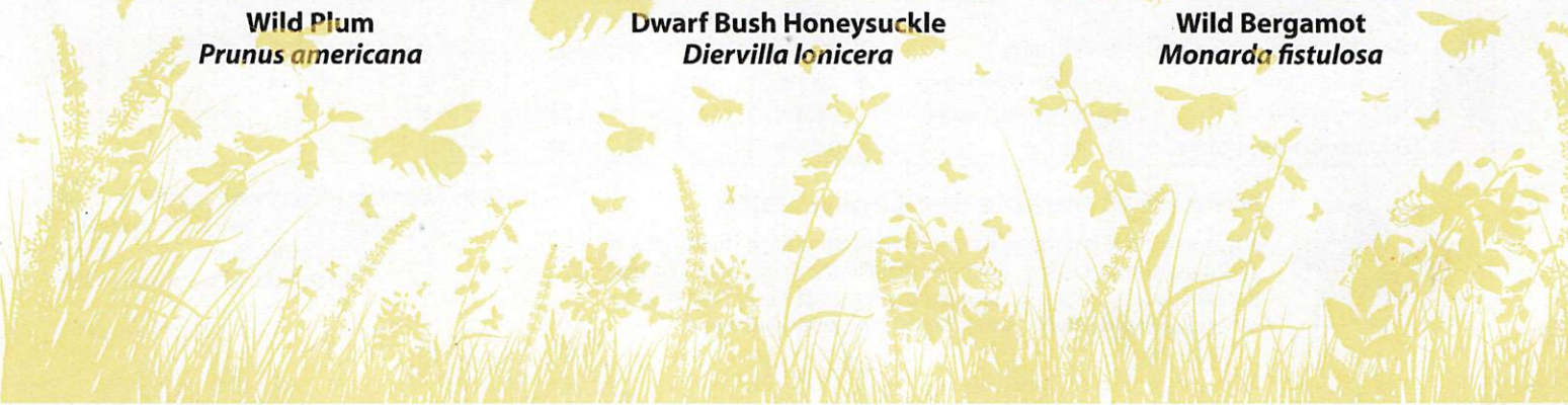
Wild Bergamot Monarda fistulosa