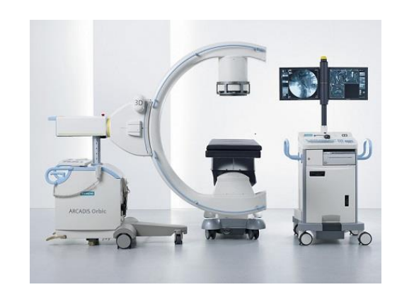
Our fluoroscopy equipment includes a high functioning C-Arm

If dialysis providers witness these recurring problems or symptoms, we are here to help.