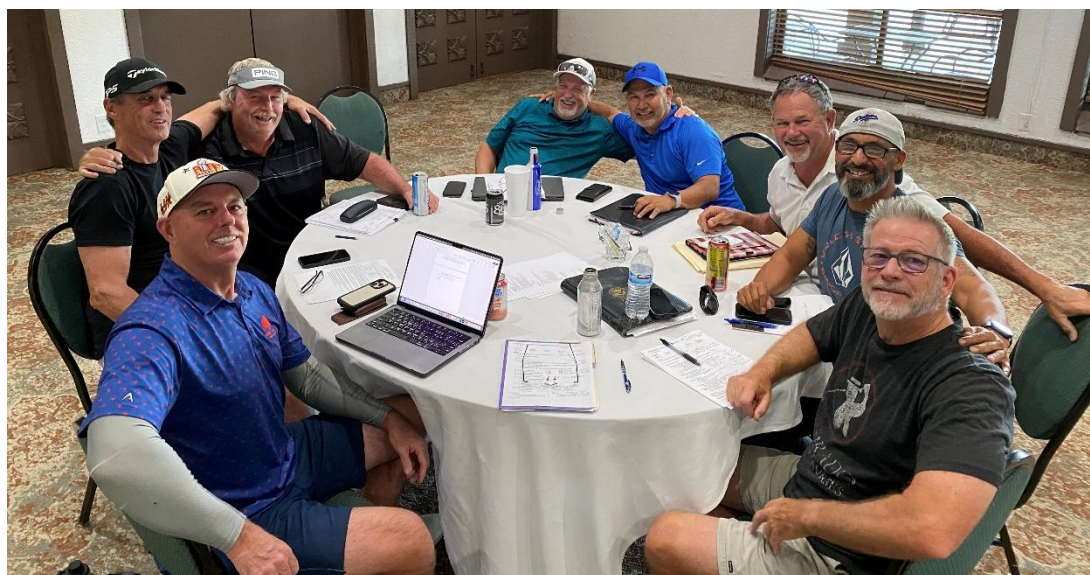
Your leaders hard at work at the monthly board meeting