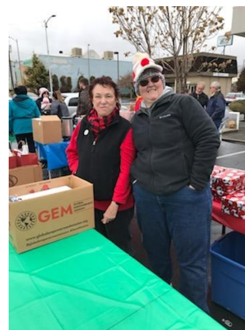
Generations working at Christmas on the Street