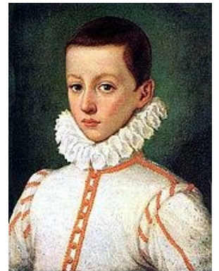
Feast Day: June 21