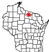
Project Location in Wisconsin

Map Date: January 16, 2026 - EJJ