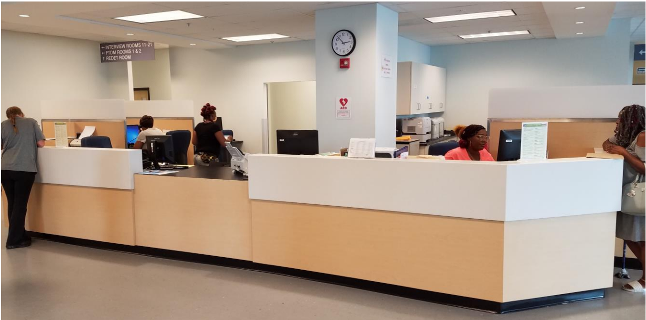
A general reception desk with 9 stations serves customers for a variety of programs.