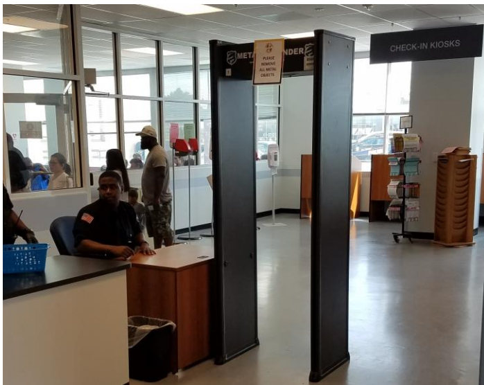
Security was enhanced while also adding open and inviting entrance and waiting areas.

The Drumcastle Government Center is located at 6401 York Road in Towson Maryland. The building is on the National Historic Registry as it was one of the first suburban department stores, but was purchased by Baltimore County and is now used as a government office building. Over 900 employees work in this building and over 300 clients per day walk through its doors.