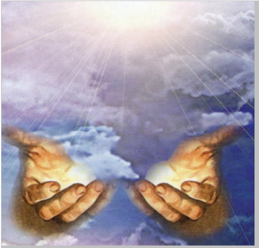
IT DEPENDS ON WHOSE HANDS IT'S IN!

Meat White Rice Fried Foods Caffeine Carbonated Beverages Foods Containing Preservatives or Additives Refined Sugar Sugar Substitutes White Flour and All Products Using It Margarine, Shortening, High Fat Products