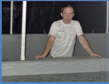
A glimpse of the lagoon on the way to lunch

questions and was always there to help us out.