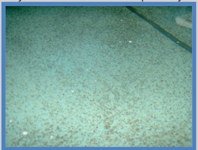
Same tank, not able to get detail. These guys are going to be switched from live food to dry food soon.