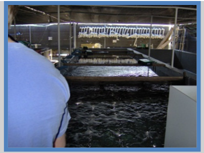
OK I still can't see. Let me go down to the other side.