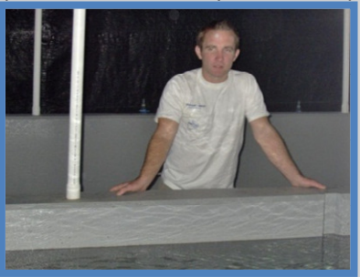
A glimpse of the lagoon on the way to lunch

questions and was always there to help us out.