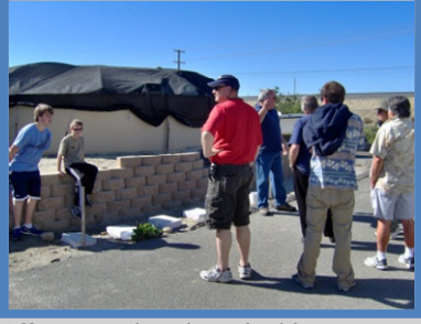
Off to see what these buildings contain. This is a very small area located right on the lagoon in Carlsbad CA