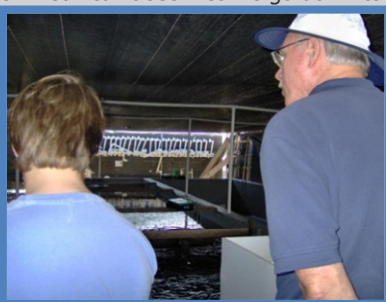
When was the last time you saw 90,000 White Sea Bass?