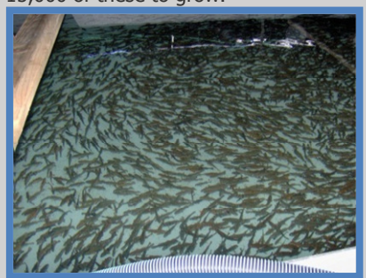
Another section of the same tank