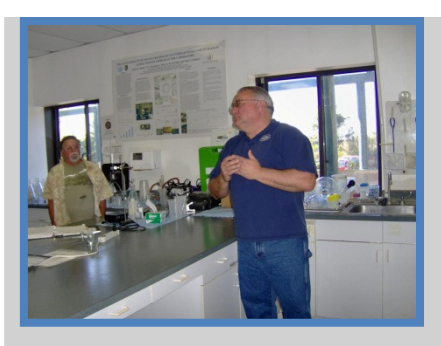
DID YOU DONATE YOUR WHITE SEABASS HEAD TODAY? I DID. And for those of you who are still asking, they want the entire head with the stones intact. Tagging machine on the right.