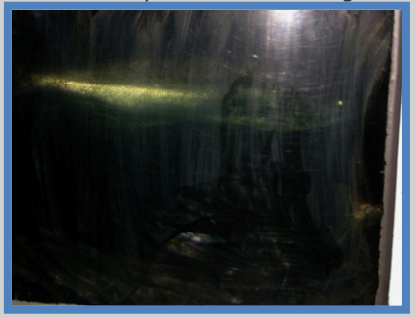
Then outside where they have the tanks for more growth. By this time they have been on a dry food for a while already.

Phil will have some great photos on 976-TUNA. We were mesmerized by these beautiful large WSB