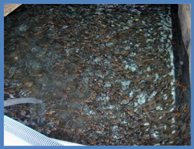
Same tank, less crowded part. It is a pity that they only want 15,000 of these to grow.