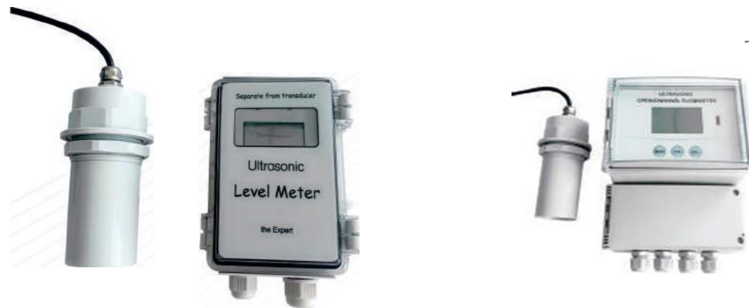
Standard Type ULM10

Remote version ultrasonic level meter is that the level meter's electronic unit (set parameters, display, the signal output) is separate from the ultrasonic probe, connected by cable each other, the ultrasonic probe is installed in the upper container, the electronic unit (i.e., host) can choose the installation location flexibly, in order to facilitate observation, operation.