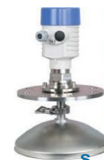
{ Horn and Parabolic}