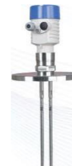
LRD703 (Double Lines/Rod)