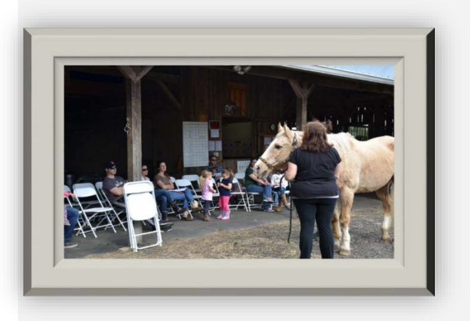
"People Helping Horses & Horses Helping People"

In 2017, FHHR provided 30 sessions in horse care, horsemanship, and groundwork, plus weekly equinetraining clinics. We held 5 events to increase public education/awareness, for teens, special needs groups, Scouts, and families. We had something going on every day in the month of April for Help a Horse Month that encompassed the ABCDEF concept: A Bonding Connection-Developing Equines and Families).