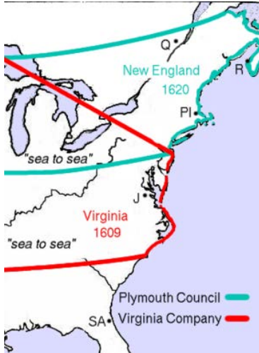
Two British Corporations Found Colonies Along the Atlantic Coast

The principal corporation during Elizabeth’s reign is known as The London Company, which is granted Atlantic coast territory extending all the way from the 34 th (Cape Fear, North Carolina) to the 41 st parallel (Long Island Sound). This results in England’s first American settlement, the Roanoke Colony, set up by Sir Walter Raleigh in 1584 on lands he calls Virginia, in honor of the Virgin Queen. But when long-delayed supply ships from England revisit the colony in 1590, all signs of the 110 settlers have vanished without a trace.