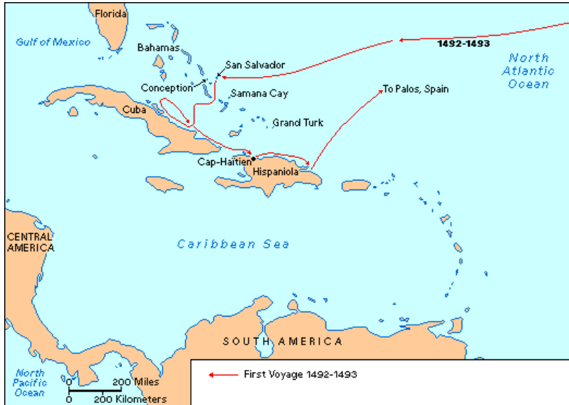
First Voyage by Columbus to the New World

Within a decade of the 1492 voyage, Europe recognizes that Columbus has reached a whole New World, rather than Asia. The Italian explorer, Amerigo Vespucci, argues this fact after his 1502 voyage, and in 1507 a German mapmaker, Martin Waldseemueller, officially christens the continent “America” in his honor.