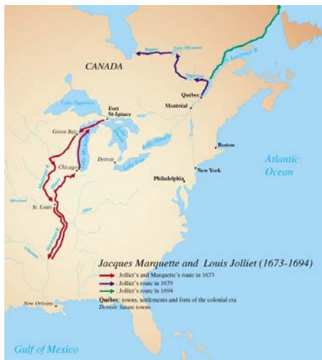
French Exploration of the Mississippi River

After a hiatus lasting six decades, Samuel Champlain retraces Cartier's route and successfully opens a French outpost at Quebec in 1608.