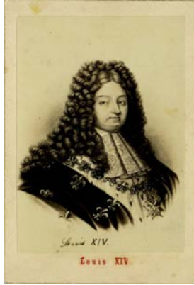
The Sun King, Louis IV of France (1638-1715)

France's interest in America picks up during the 72 year reign (1643-1715) of Louis XIV, the Sun King, who is arguably the dominant force in Europe in his time.