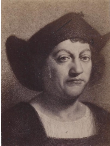
Christopher Columbus (1451-1506)

The European intrusion into the New World begins by accident.