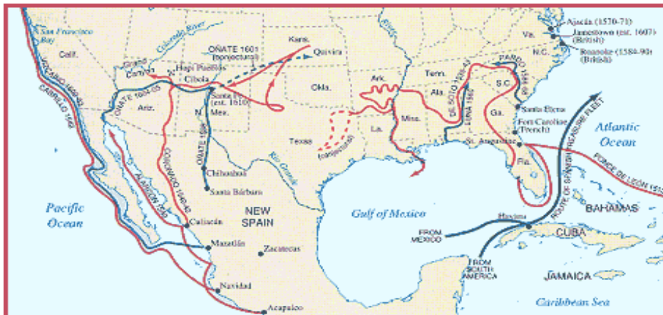
Spanish Exploration of North America

In turn America becomes a sought-after chip in the game played by the monarchs of Spain, France and England for control over Europe and for global hegemony.