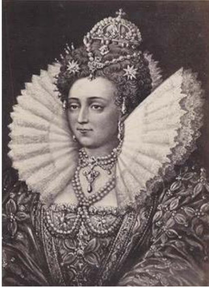
Queen Elizabeth I of England (1533-1603)

Aside from John Cabot's 1497 voyage to Newfoundland, the English show little early interest in the New World.