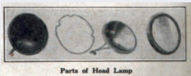
Parts of Head Lamp

Ford's headlamp is divided into the parts shown in the illustration below. Note the reflector spring placed inside the bucket edge. This spring has to be in place correctly to provide the tension needed.